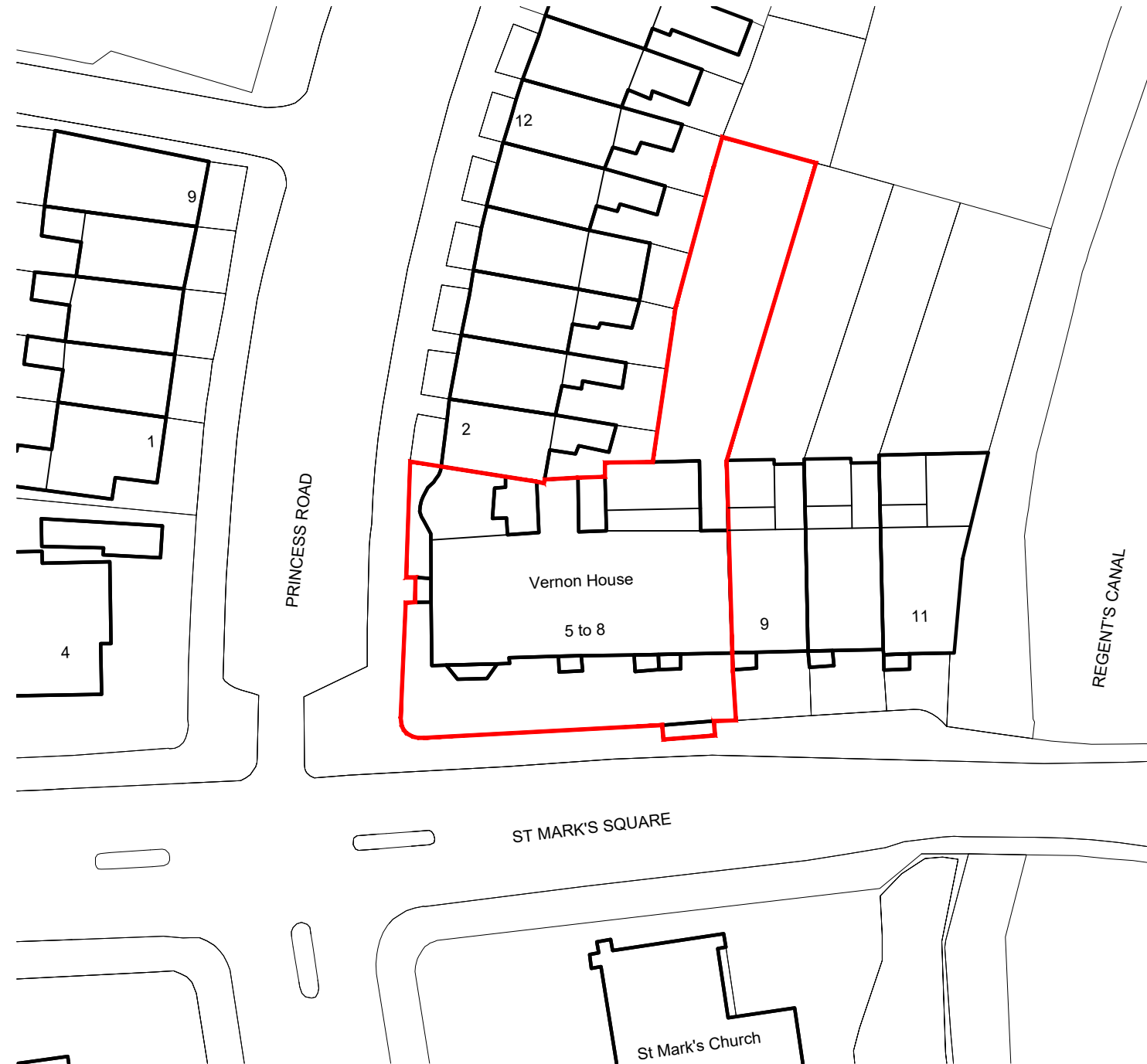
01 Block plan 1:500 @ A3