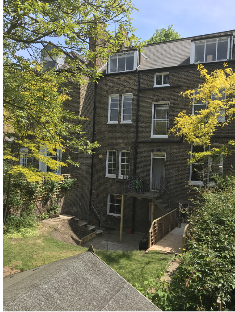
View of rear elevation looking towards 13 Burghley Road