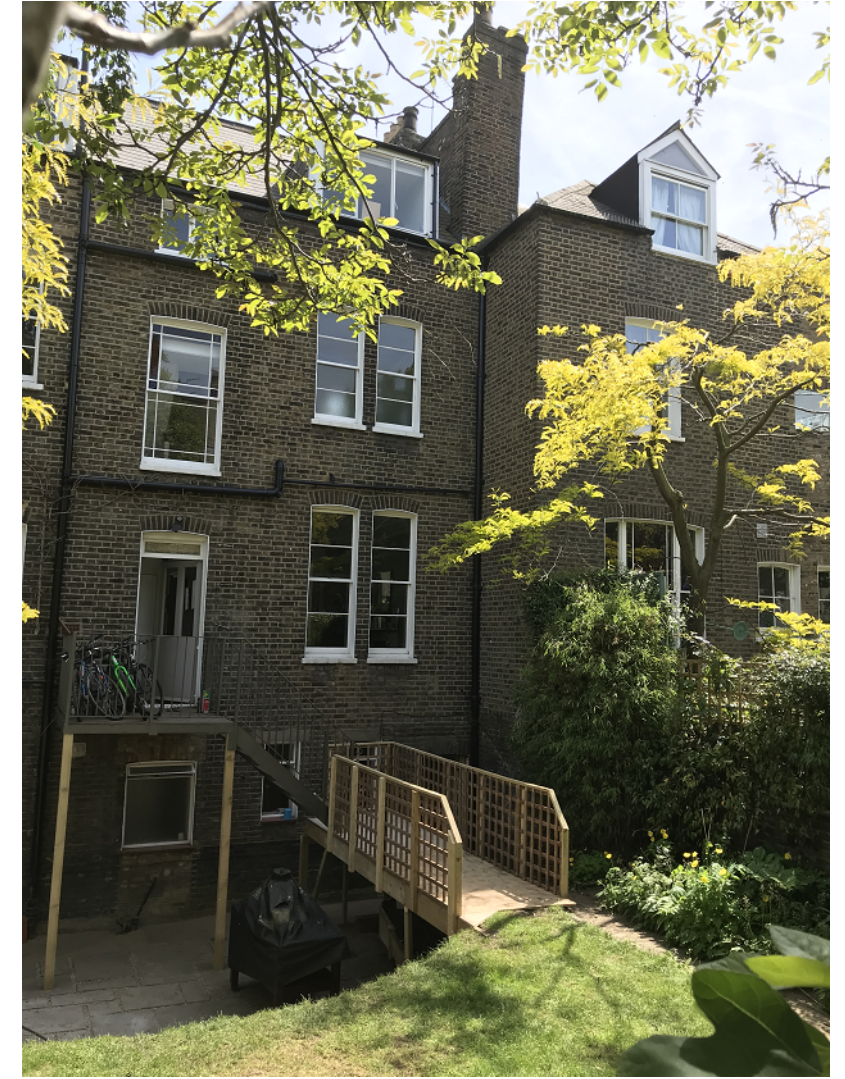
View of rear elevation looking towards 9 Burghley Road