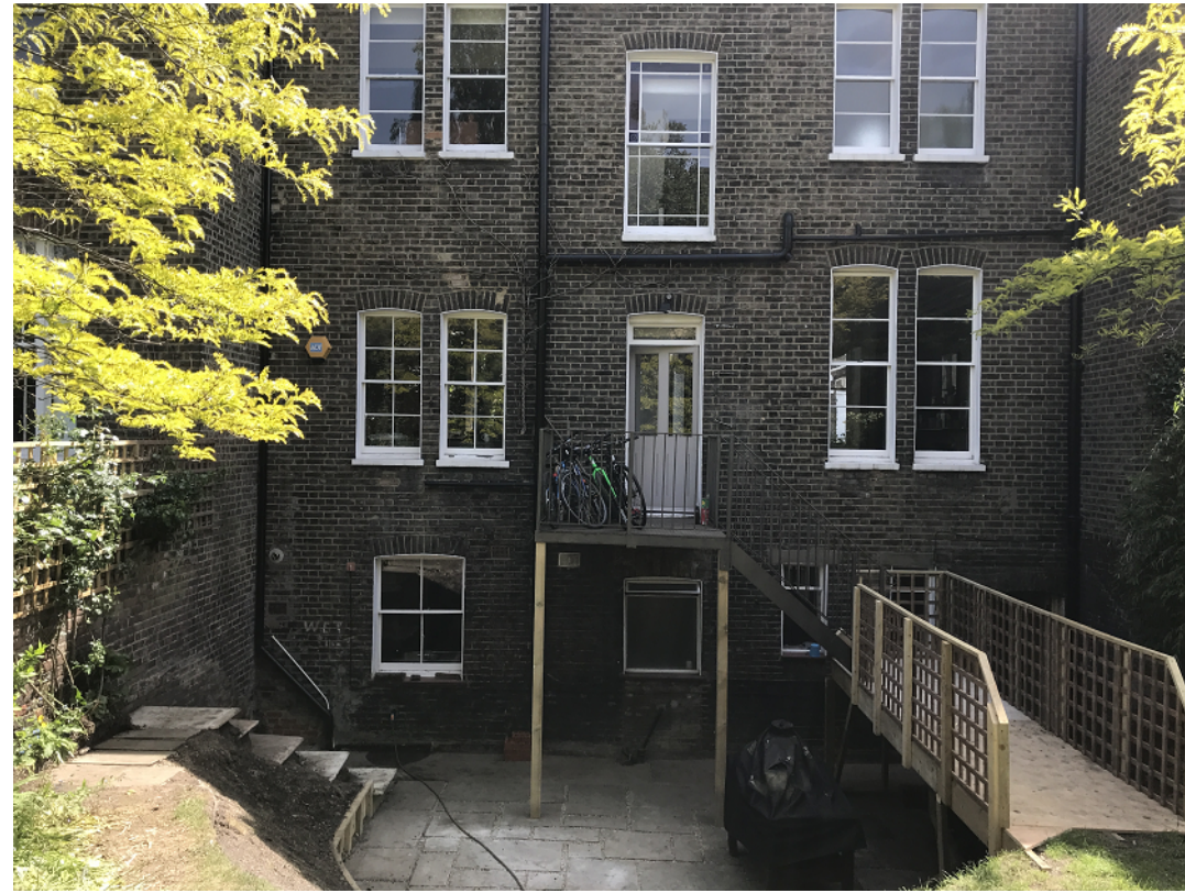
View of rear elevation