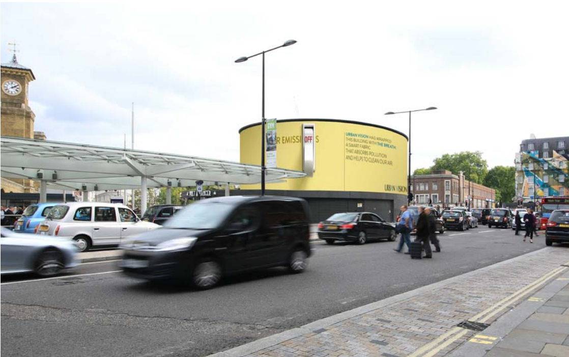
02 Proposed-South/West view