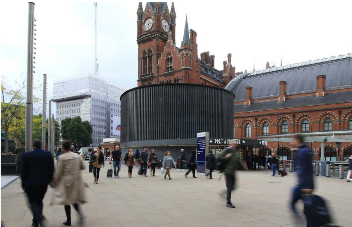
03 Existing-South/East view