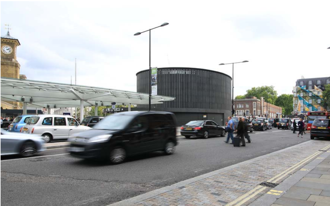
01 Existing-South/West view