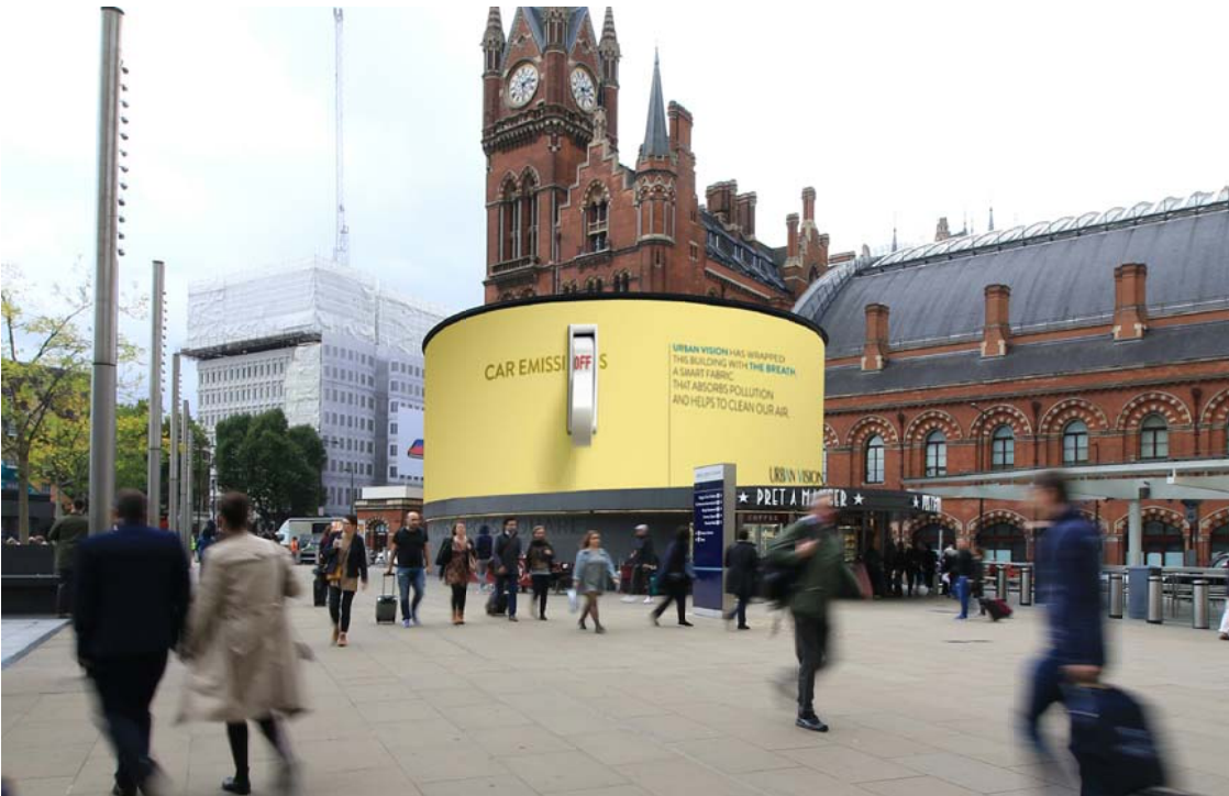
04 Proposed-South/East view