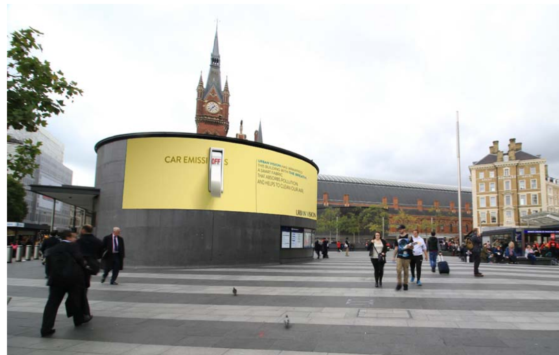
04 Proposed-South/West view