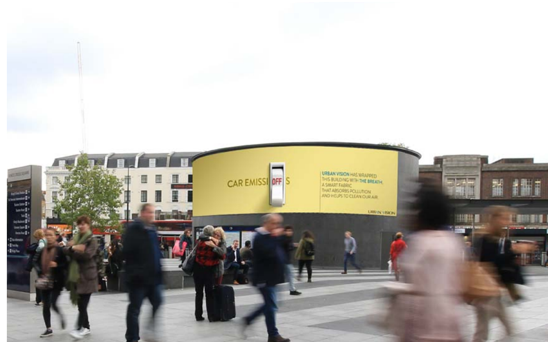
02 Proposed-South/East view