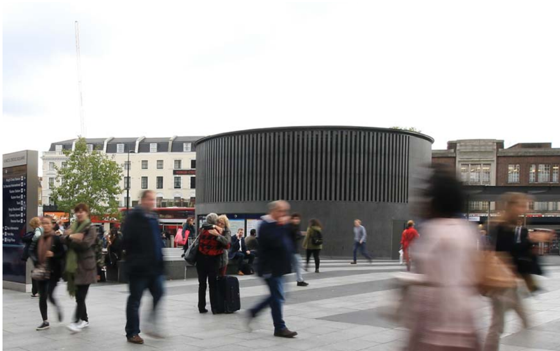
01 Existing-South/East view