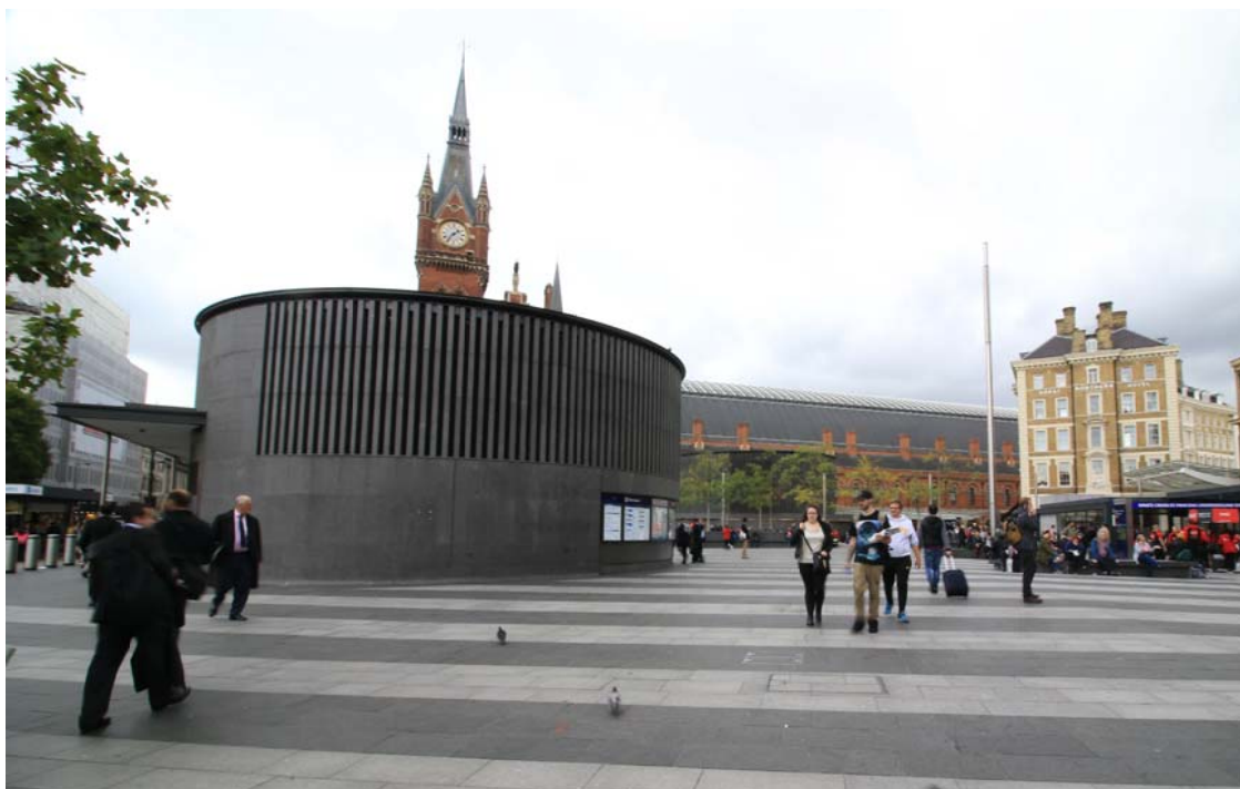
03 Existing-South/West view