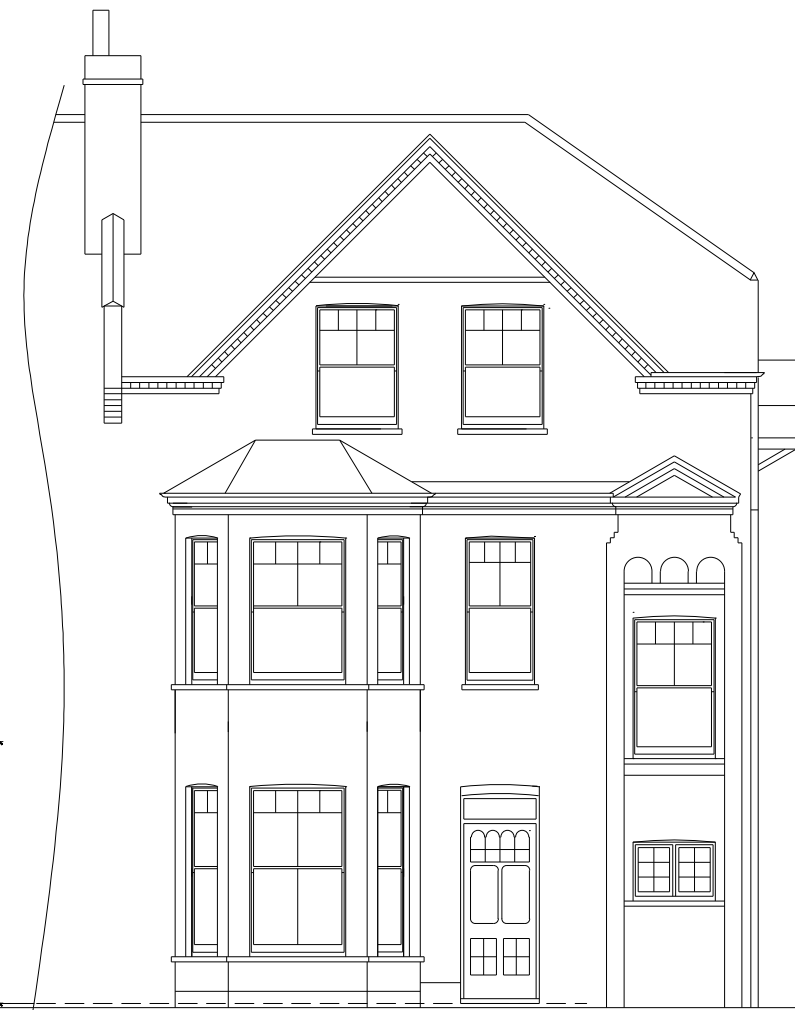
Front (North West) Elevation