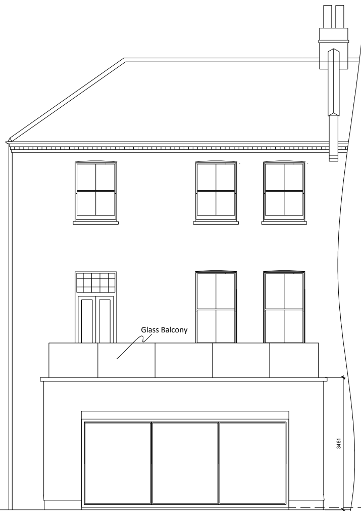
Rear (South East) Elevation