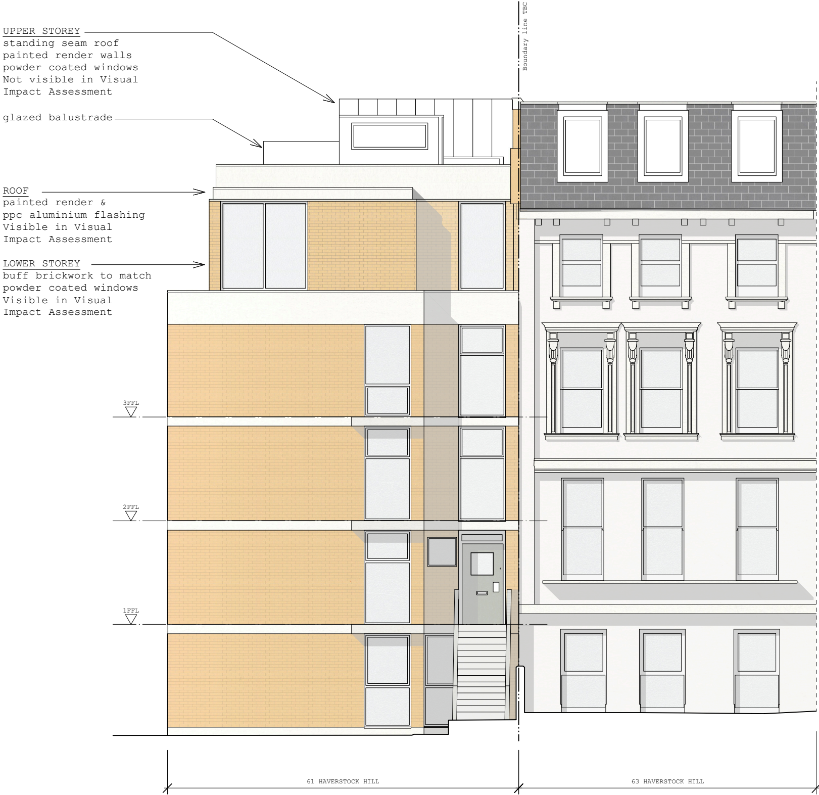
01 Proposed Front Elevation