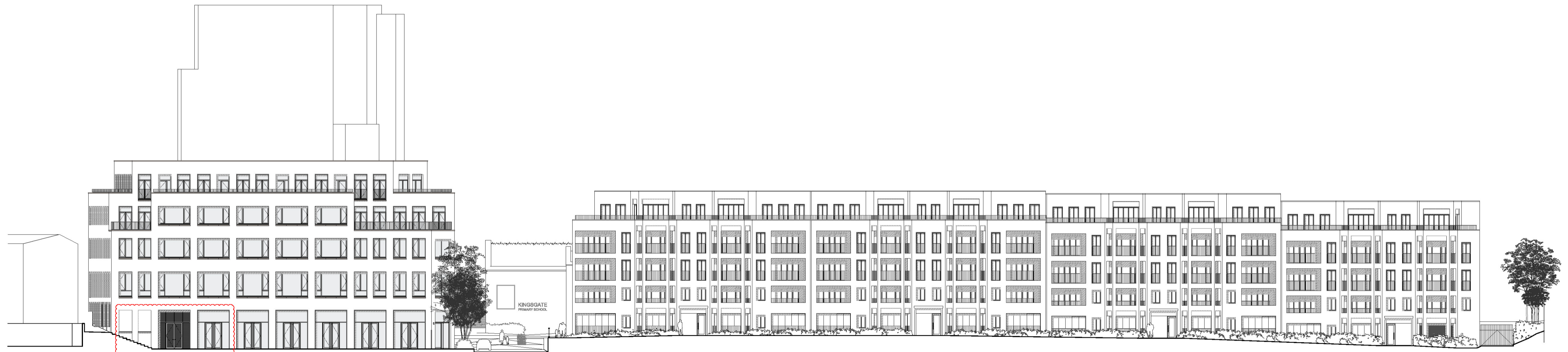
PROPOSED CONTEXT SECTION SW1