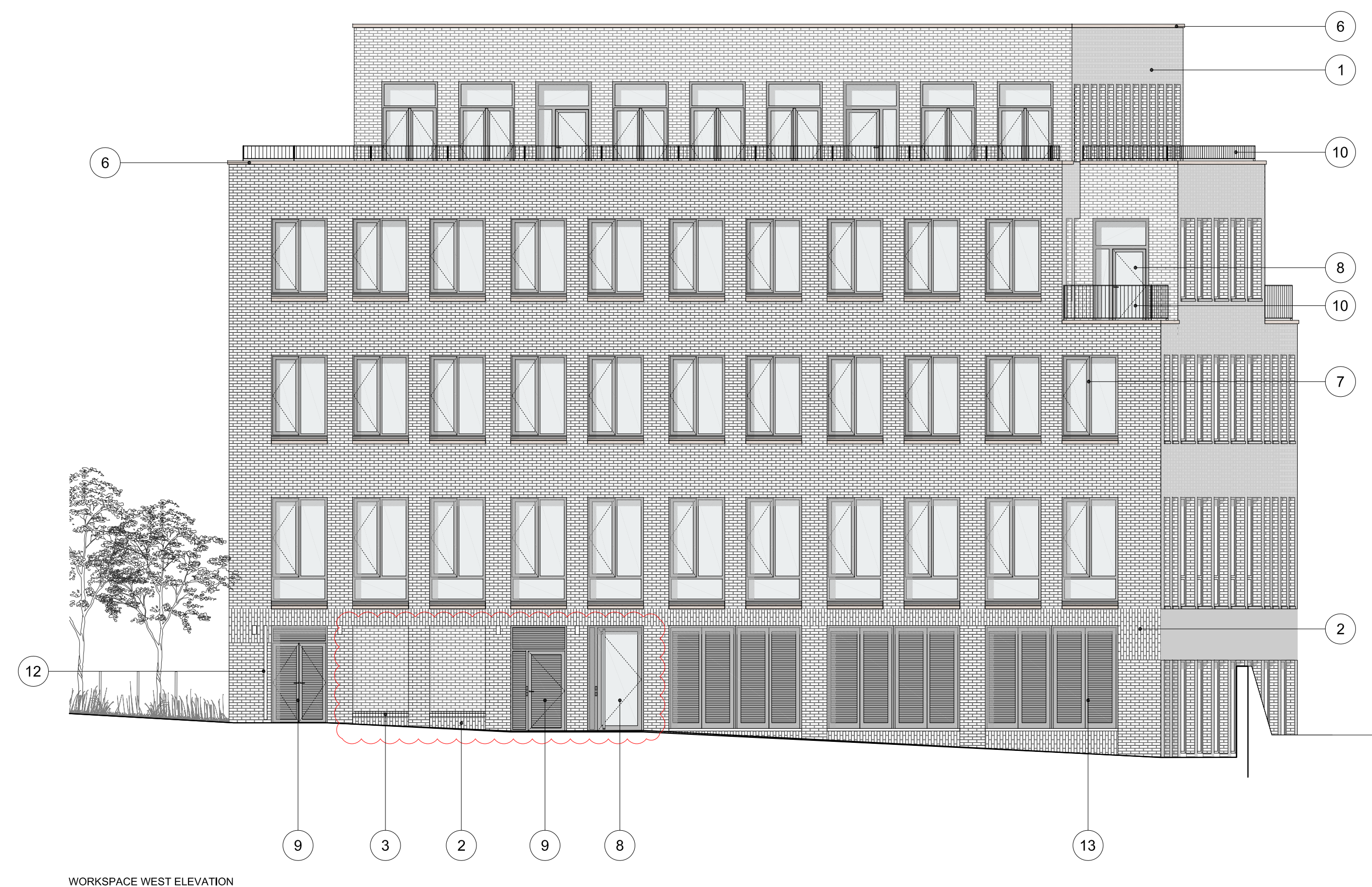
WORKSPACE WEST ELEVATION

For proposed landscape information refer to JCLA landscape drawings submitted as part of this planning application