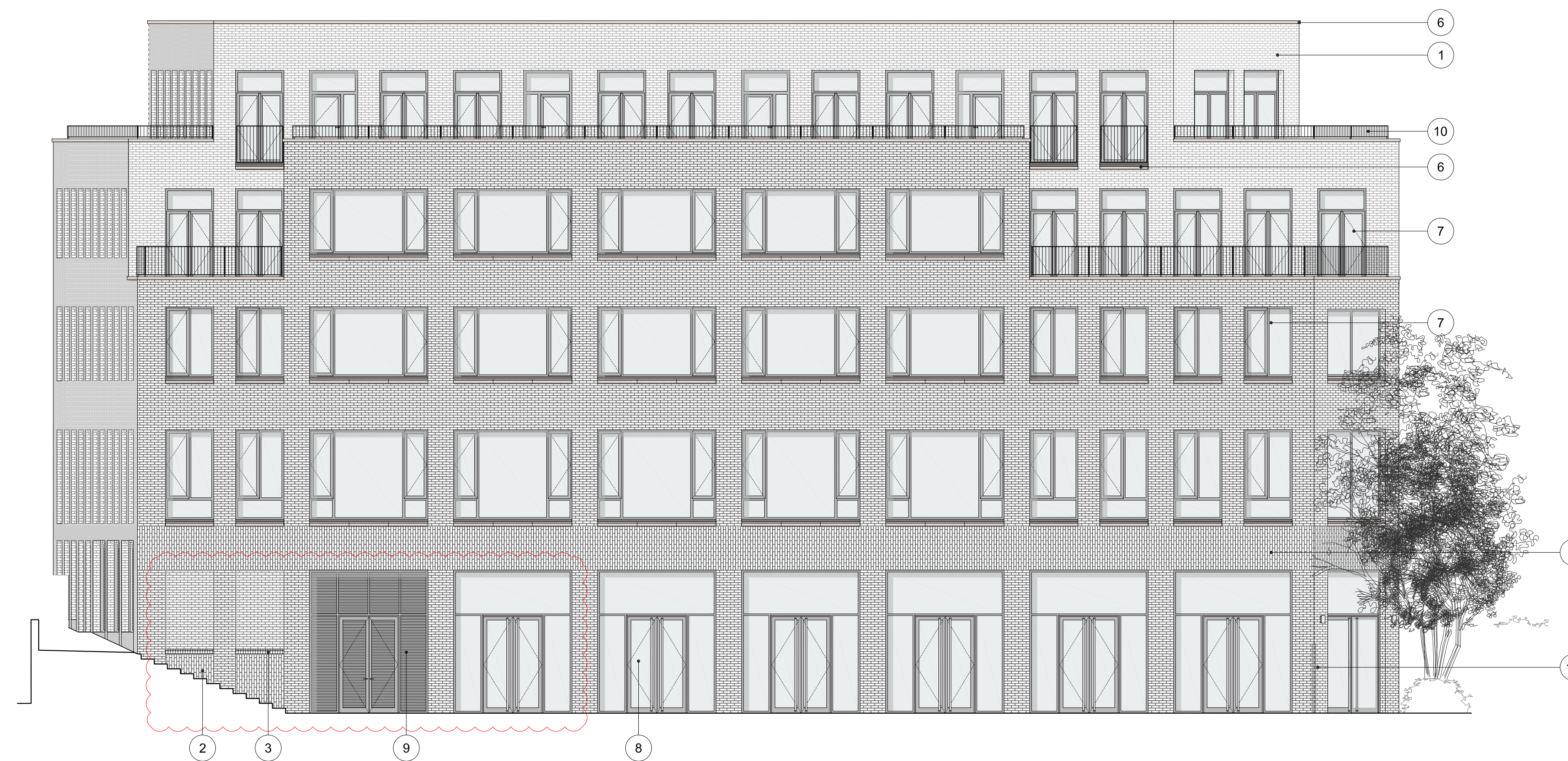
WORKSPACE SOUTH ELEVATION

For proposed landscape information refer to JCLA landscape drawings submitted as part of this planning application