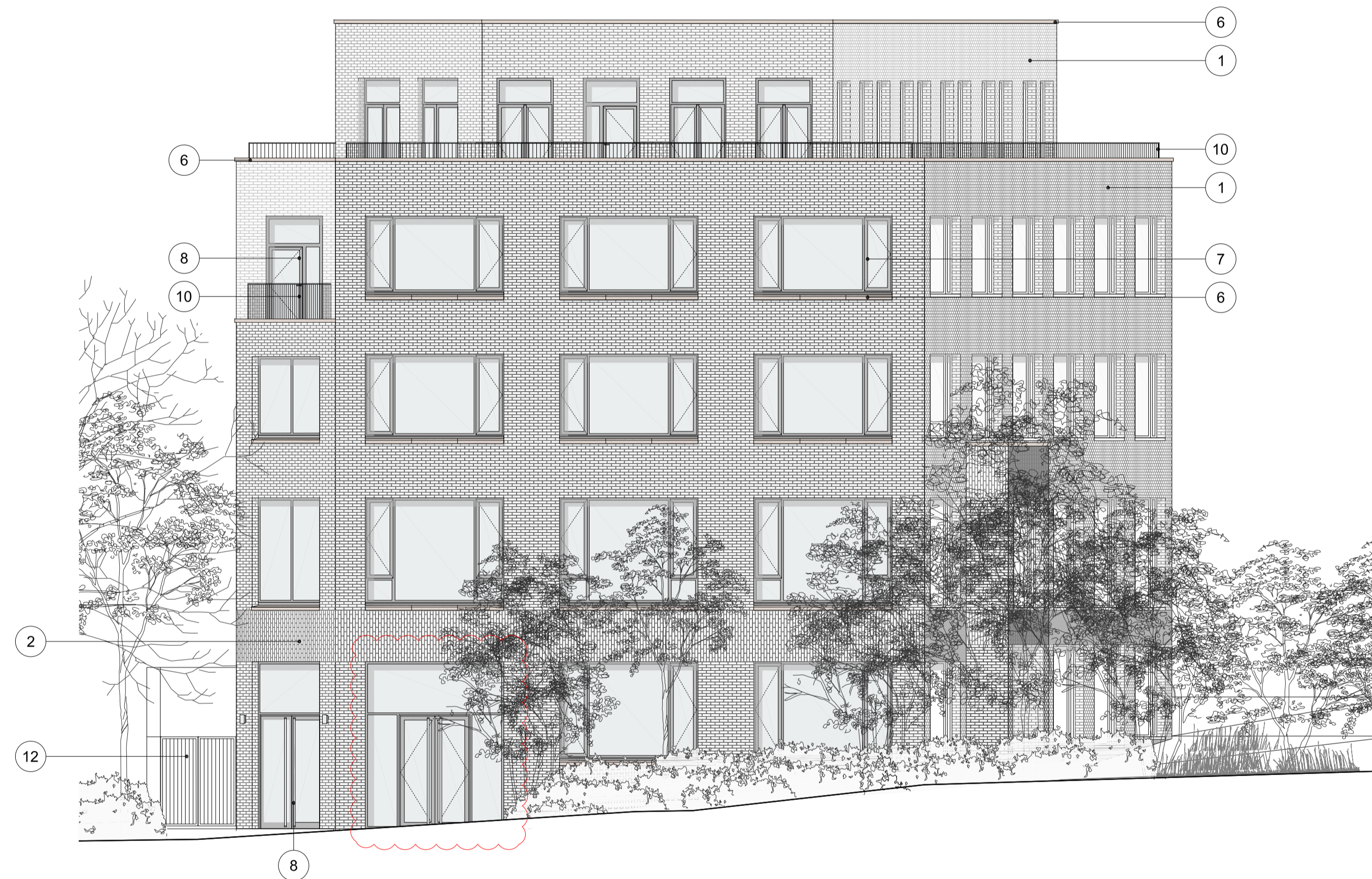
WORKSPACE EAST ELEVATION

For proposed landscape information refer to JCLA landscape drawings submitted as part of this planning application