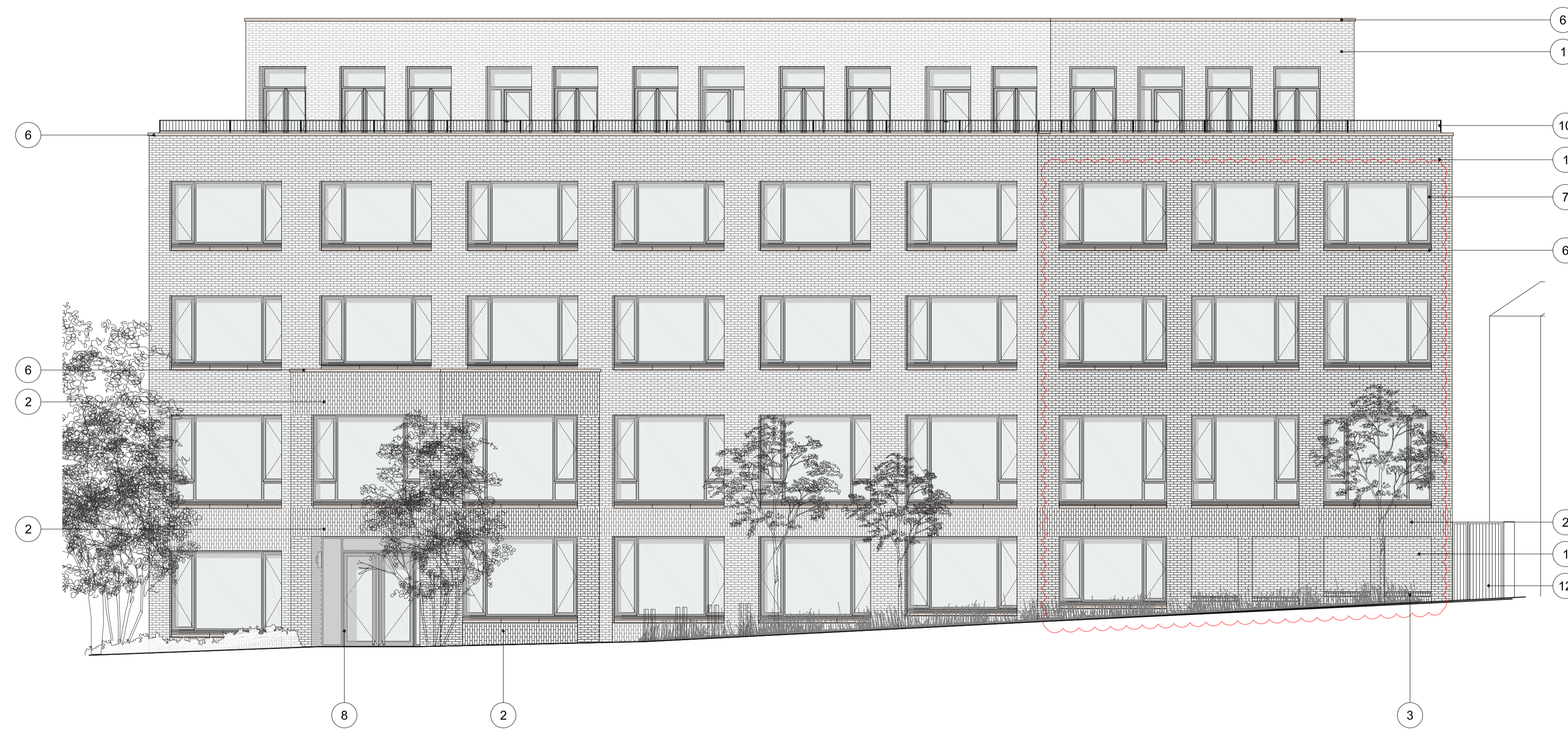
WORKSPACE NORTH ELEVATION

For proposed landscape information refer to JCLA landscape drawings submitted as part of this planning application