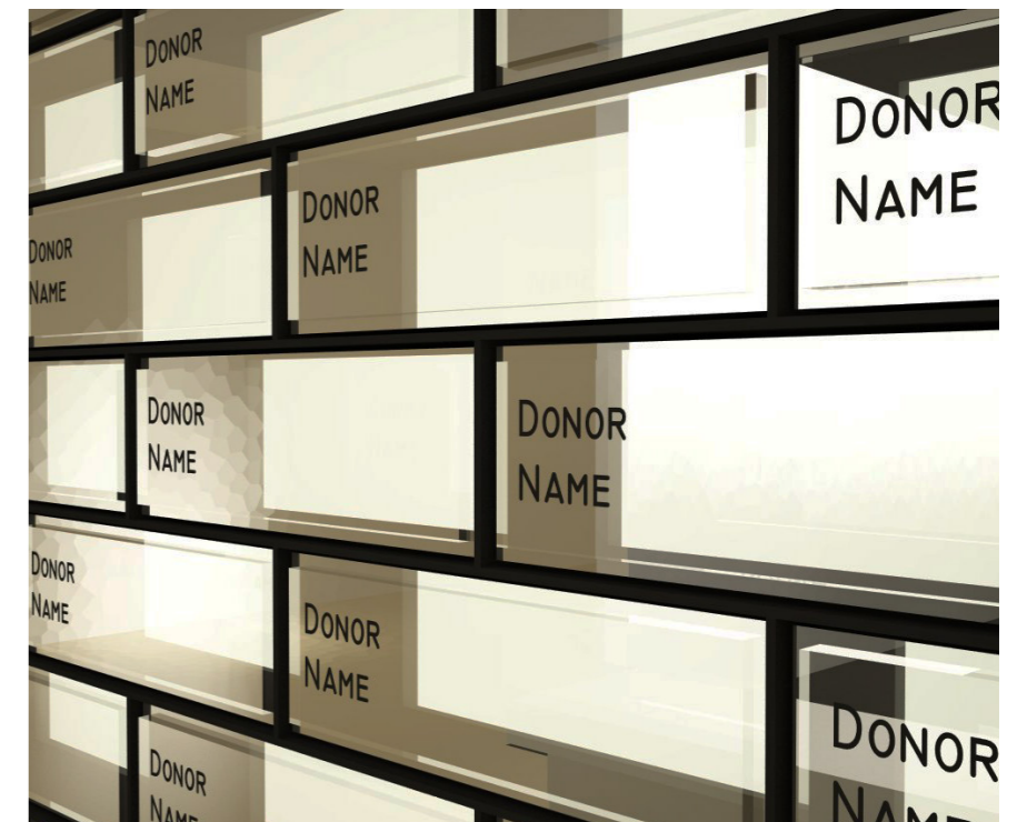
Backlit resin bricks within an acrylic shelf-style frame