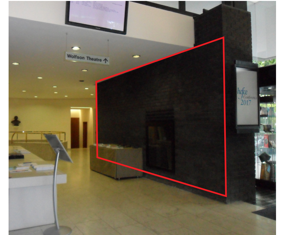
Linacre Wall Proposed Location