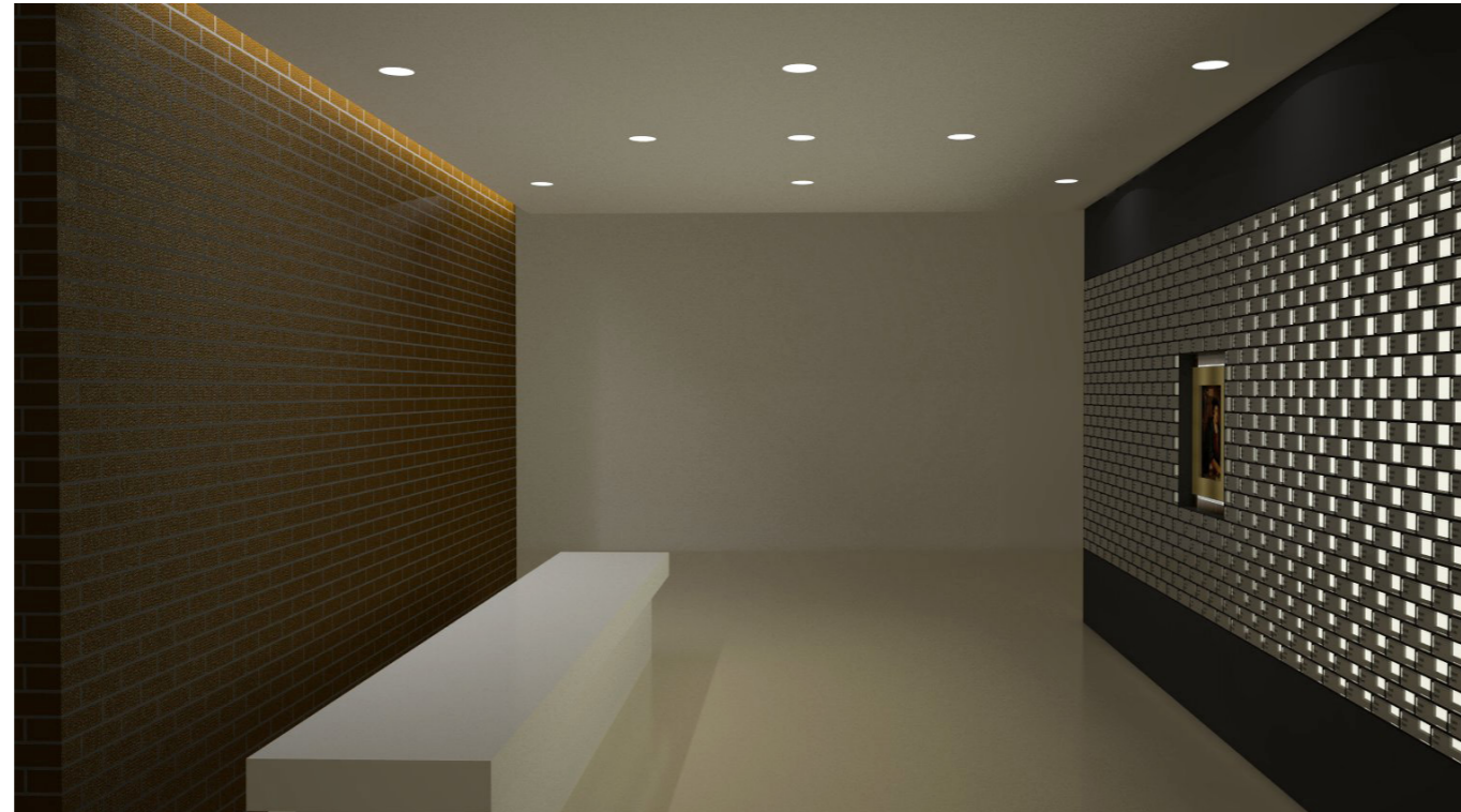
View showing Linacre Wall