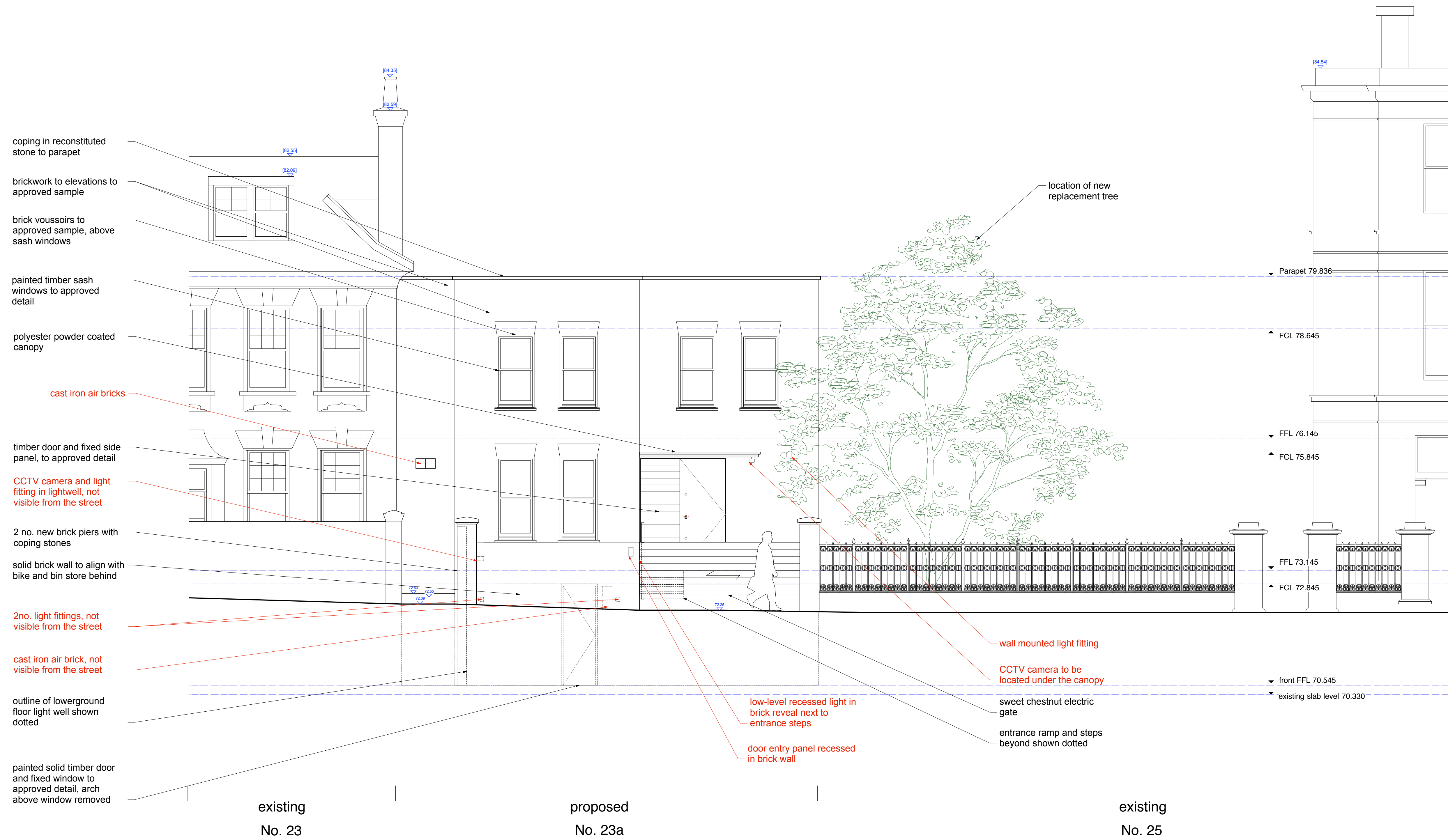
1 Proposed Front Elevation_Street Elevation Scale: 1:50