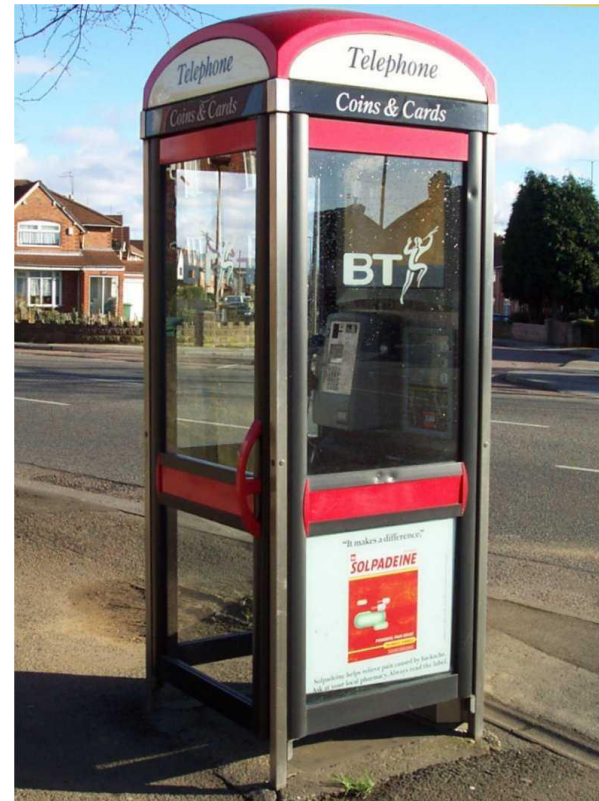
BT KX100+ kiosk