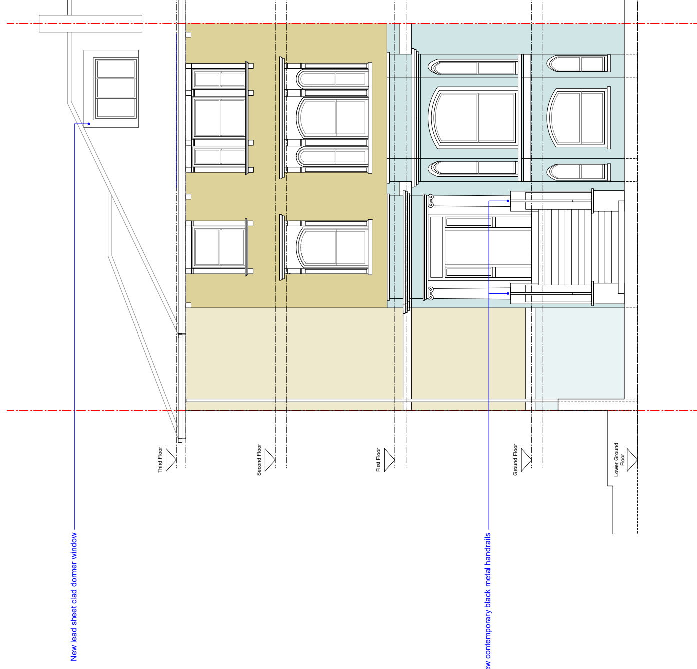
01 P200 proposed front elevation scale 1:50@A1 1:100@A3