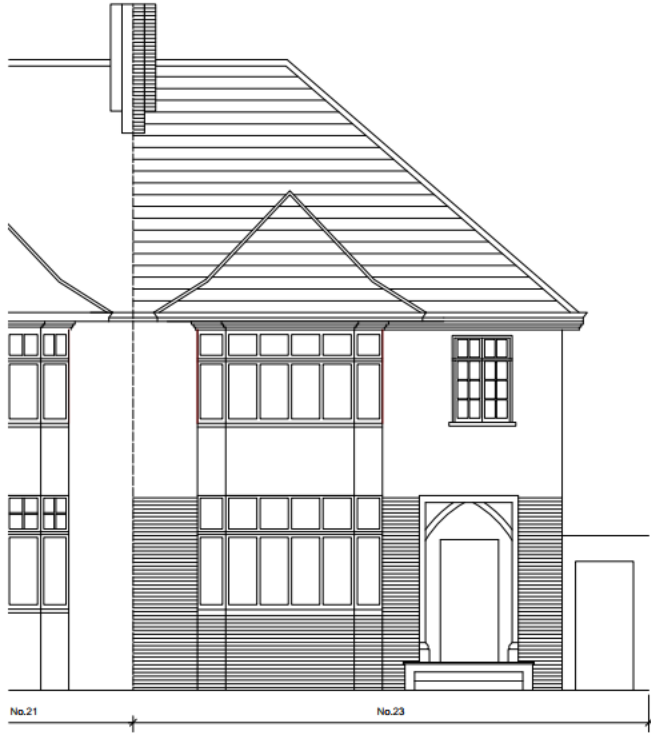
1 Existing Front Elevation Scale: 1:50