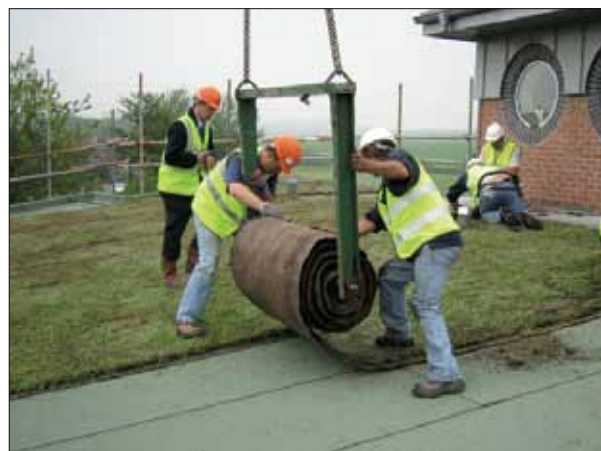
▲ Long length rolls being craned into position and installed.