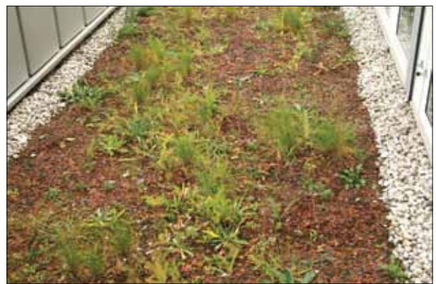
▲ At 12 - 16 weeks