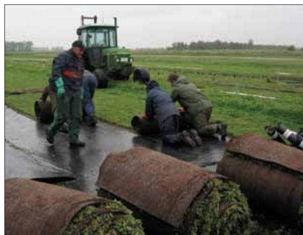
▲ Rolls being harvested and prepared for delivery.

It may also be necessary to irrigate for longer than this if installation is followed by a warm, dry spell of weather. To encourage the plants to survive without topical irrigation and harden them ready to survive the winter it is important to start cutting back watering from early September. The maintenance requirement in the years following installation will depend upon the weather experienced through the winter and early spring of each year and should follow our standard extensive green roof maintenance guidelines, excepting where weather conditions have caused significant damage to the vegetation.