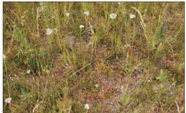
▲ The second growing season