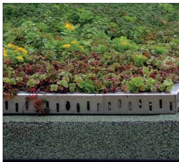
▲ Bauder SS40 Drainage and Edge Trim