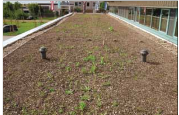
▲ After about 8 weeks

Due to the components incorporated within the seed mix there is no requirement for establishment maintenance. It is advisable to ensure that the roof surface is not trafficked other than for essential roof maintenance for the first 12 months after sowing. Bare patches can be over-sown if considered necessary, but will develop vegetative cover over time in any case. The anticipated period of establishment to provide a good vegetated cover is at least two years.