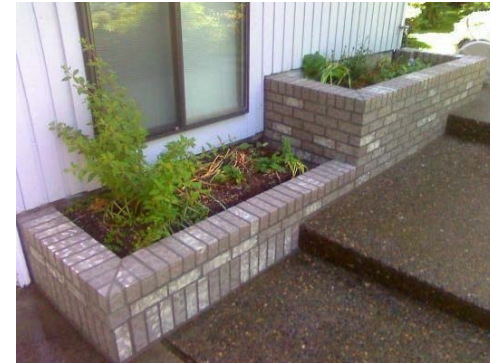
Above: Example of Permeable Brick Planter