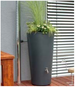
Above: Example Water Butt