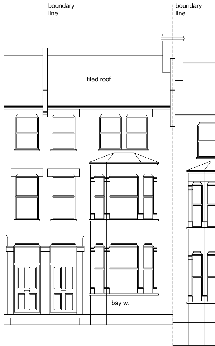
Front Elevation 'As Proposed' S: 1/100 (There will be no alteration to the front elevation, apart from repair/renovation works)