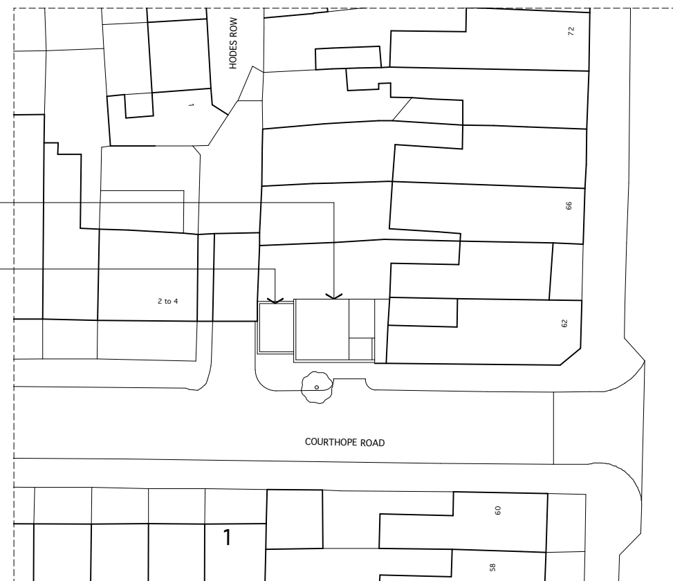
EXISTING SITE PLAN [1:500 @ A3] 0 5m 20m