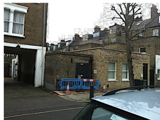
Existing photographs taken from Courthope Road