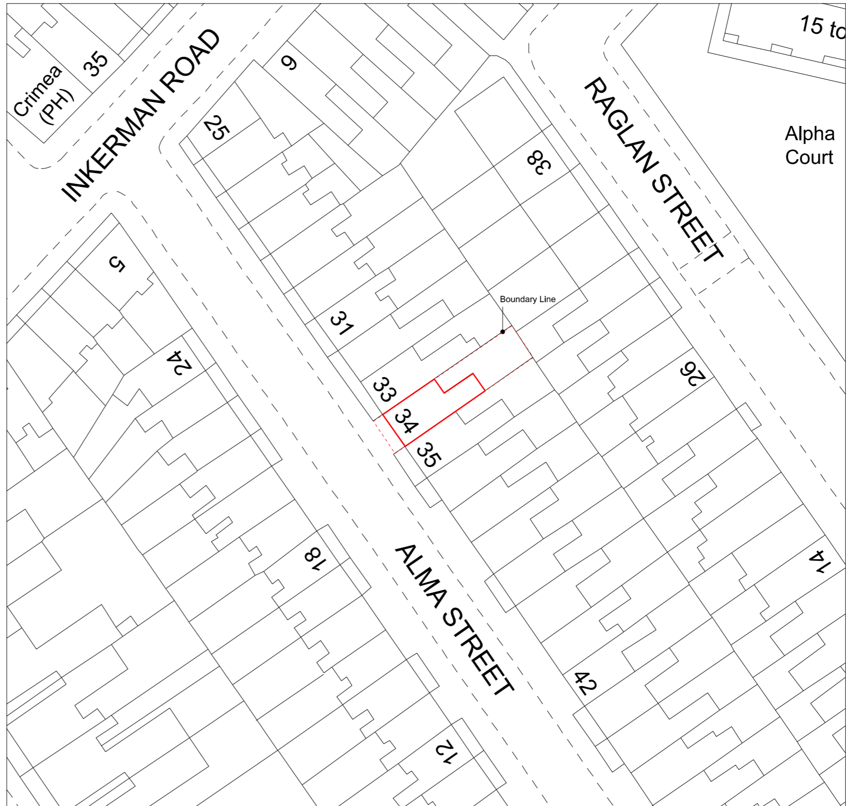
01 - LOCATION PLAN - 1:1250 @ A3