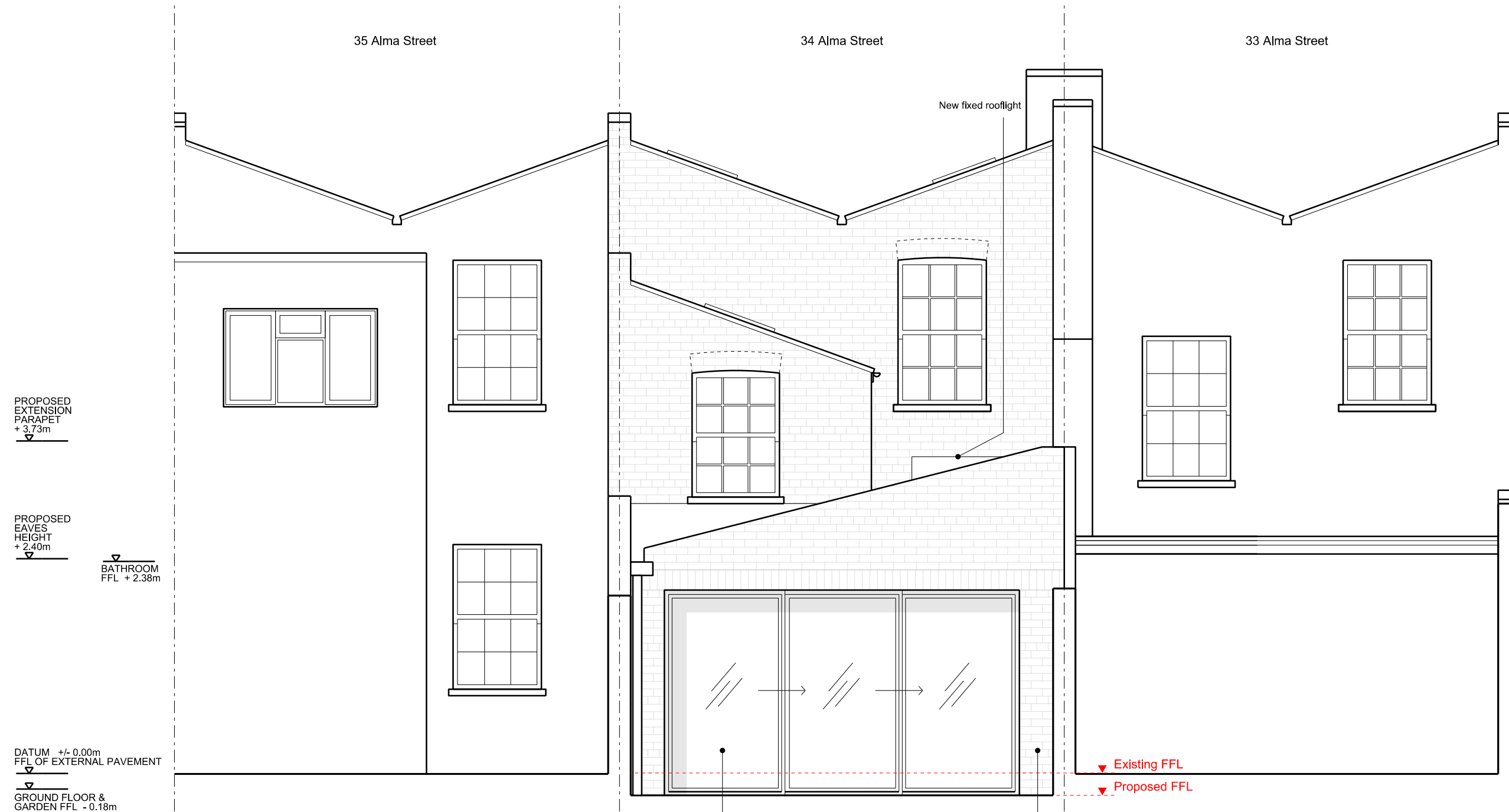
Proposed Rear Elevation 1:50