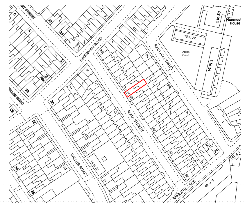
LOCATION PLAN 1:2000 @ A3