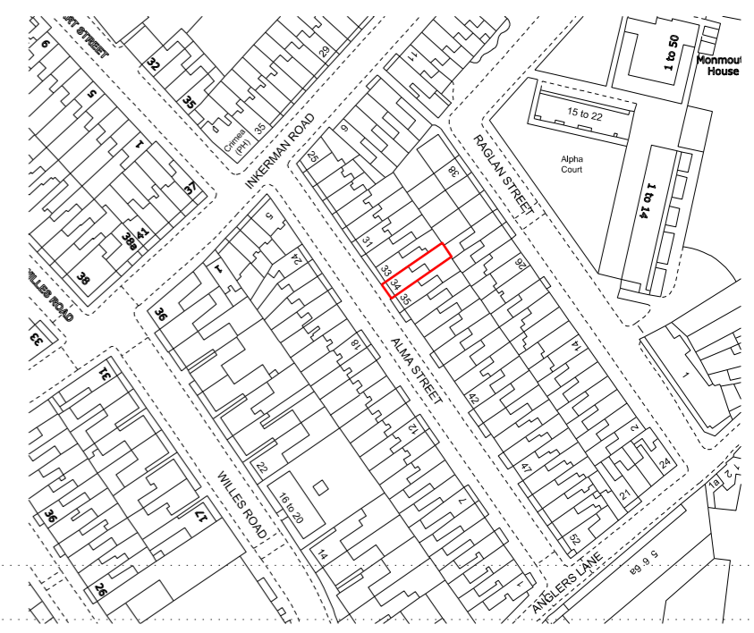
LOCATION PLAN 1:2000