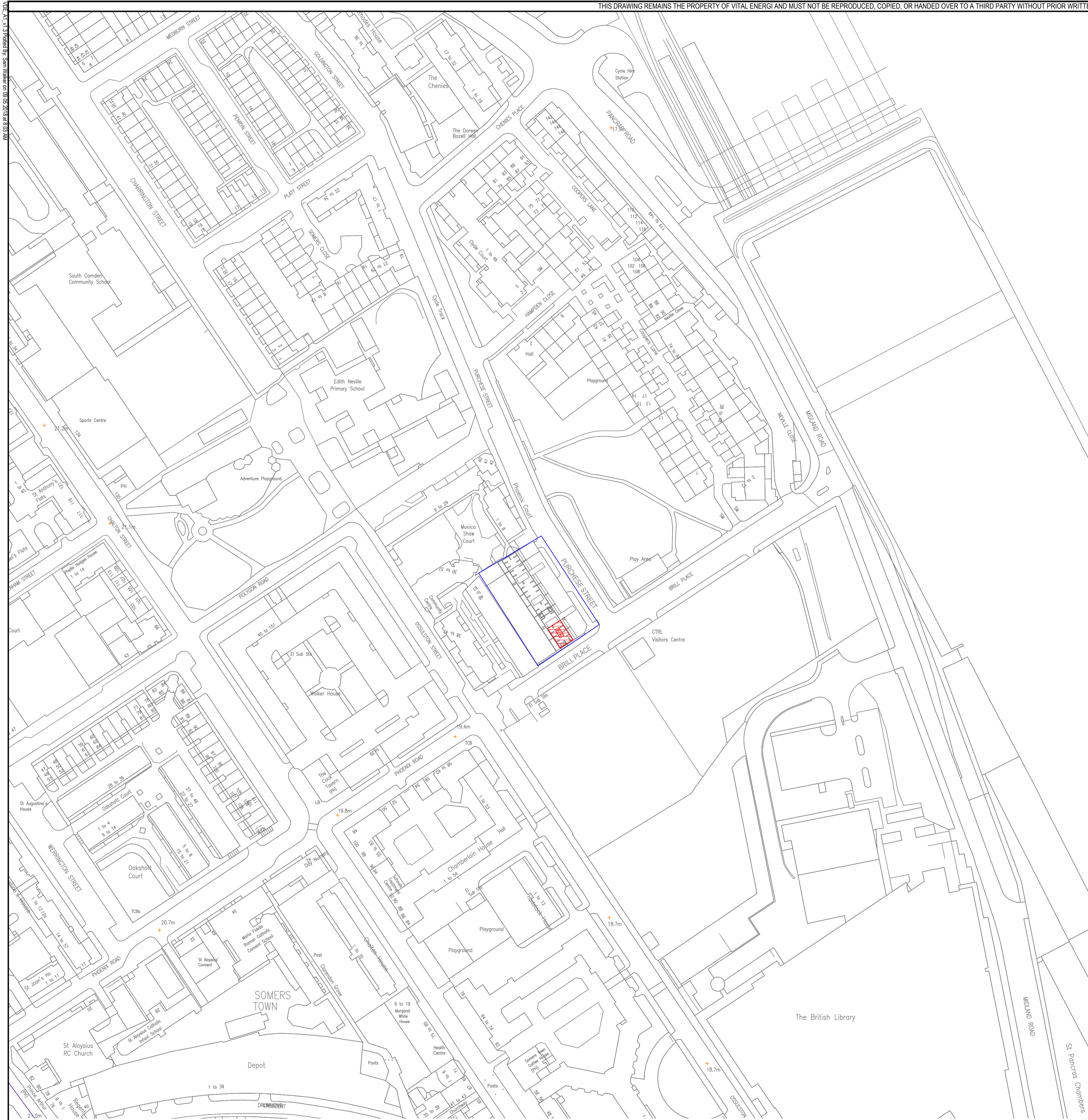
SITE PLAN 1:1000