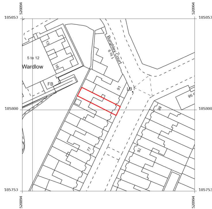
OS PLAN Scale 1:1250@A3