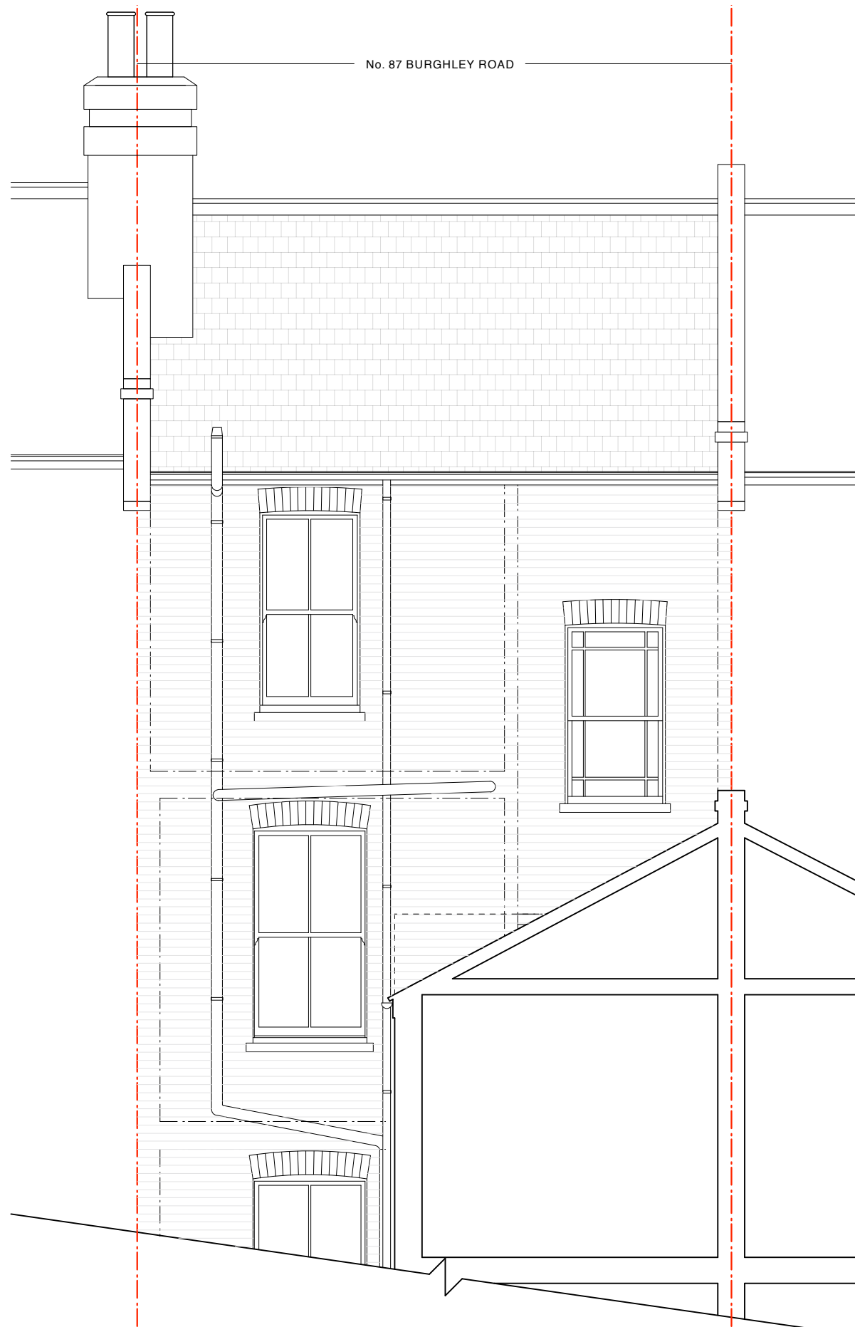
SECTION AA AS EXISTING