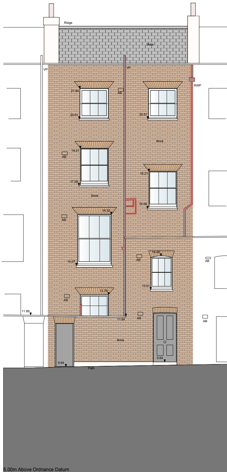
STREET REAR ELEVATION