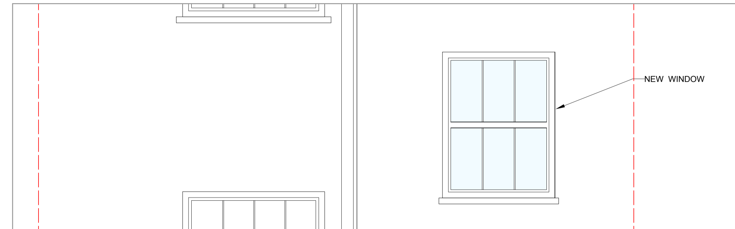
REAR ELEVATION DETAILS scale 1:20