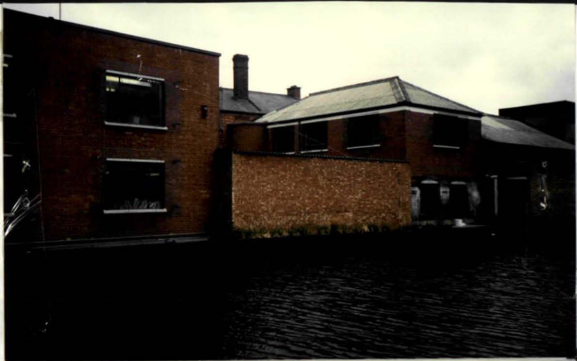
38-40 St. Pankras Way 25-7-86.