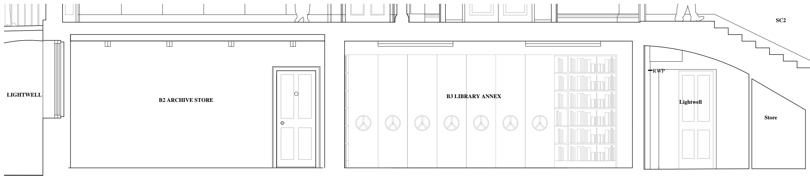
EXISTING SECTION A - NO. 16