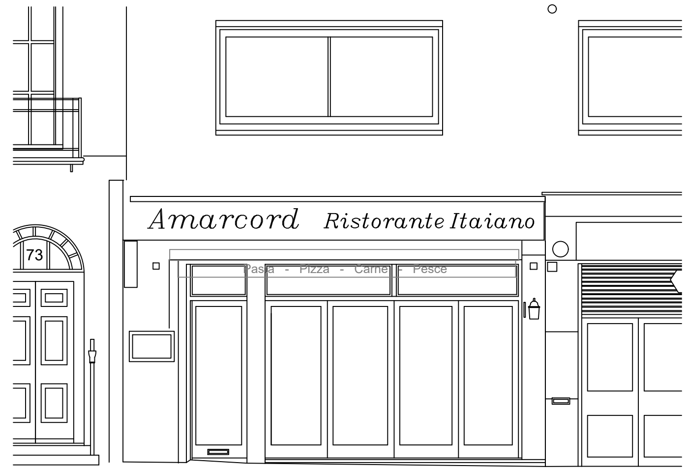
Existing Shopfront scale: 1:50@A3