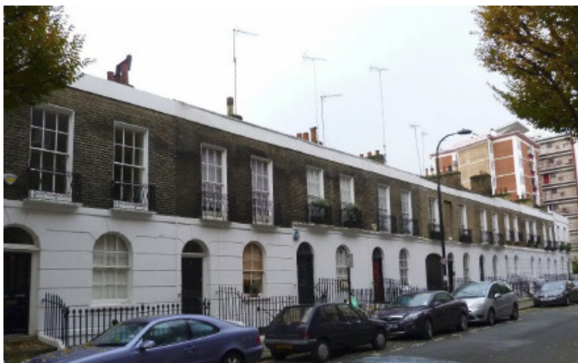
Fig 3 Thanet Street - street view