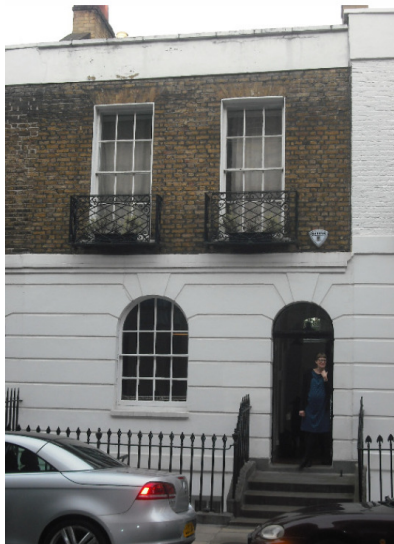
Fig 1 No 9 Thanet Street