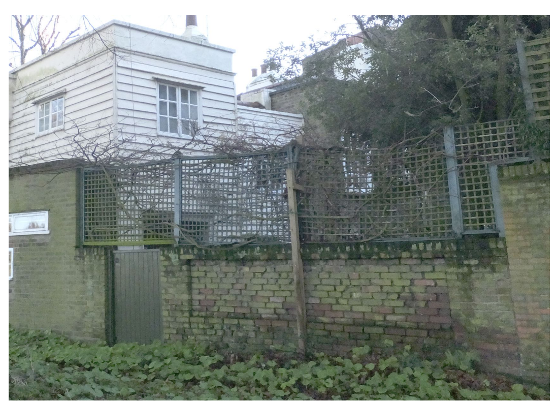
Photograph 01 - level of pre-existing trellis