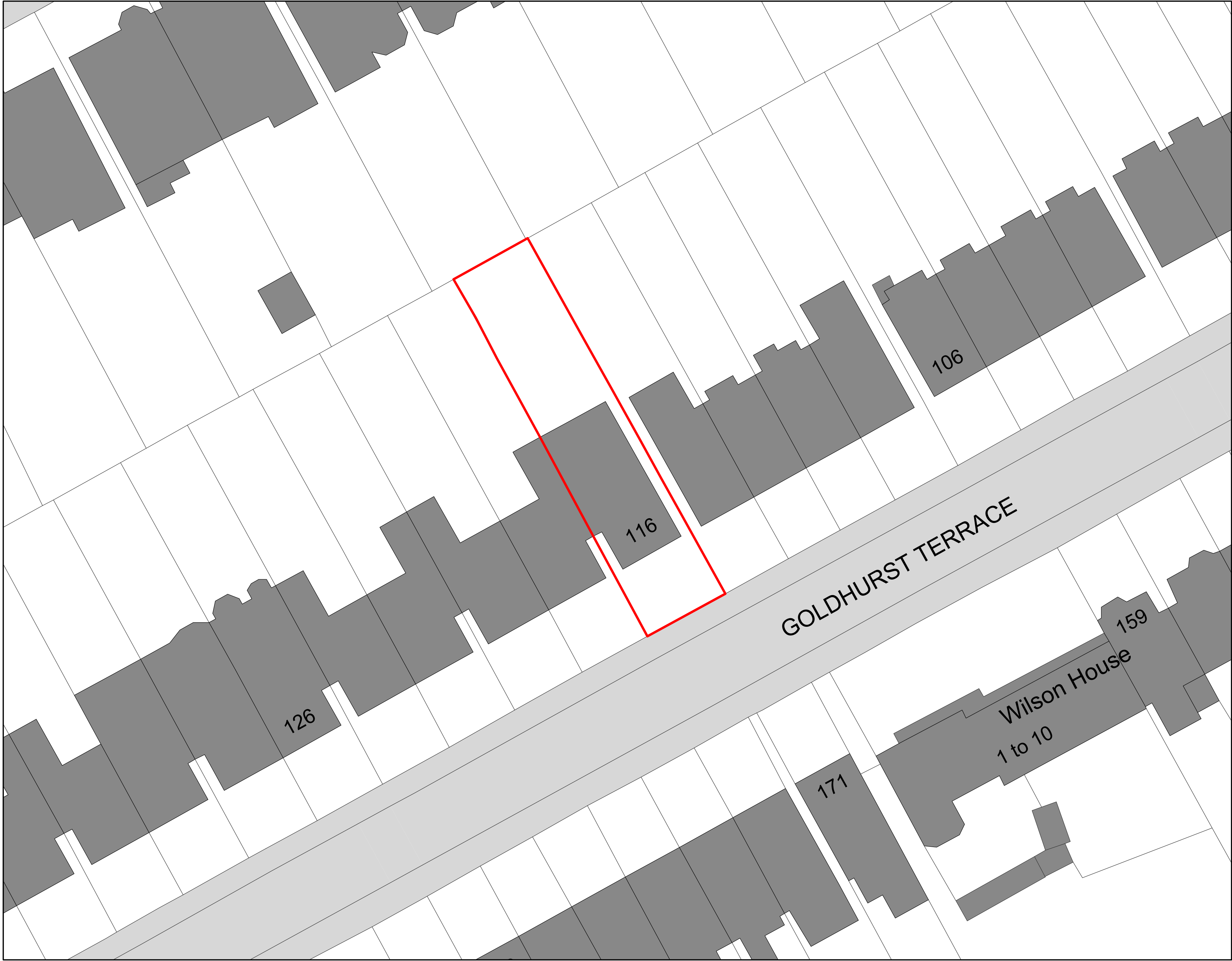
1 SITE PLAN SCALE 1:1500 @ A3