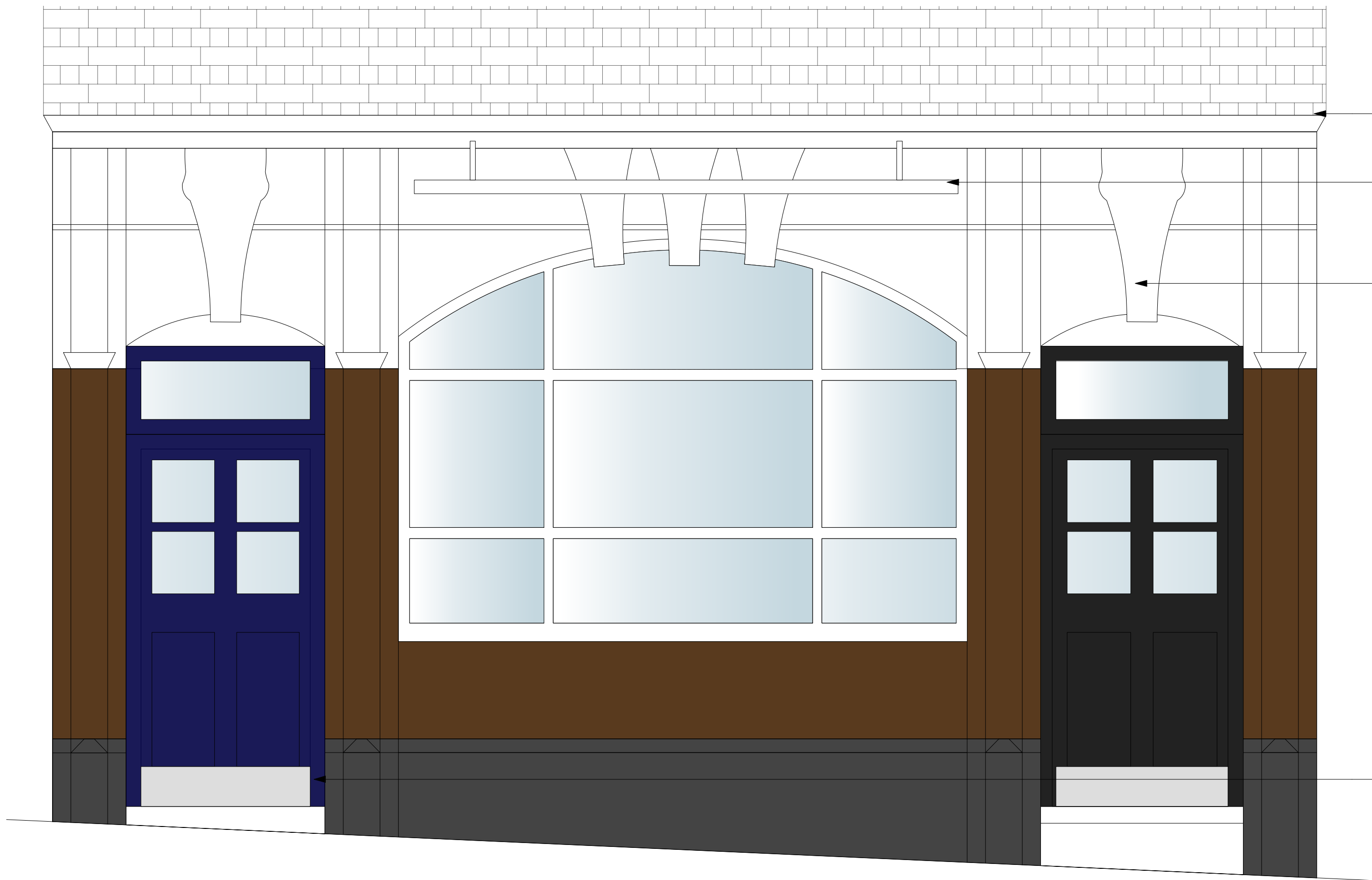
1 Existing External Elevation Scale: 1:20