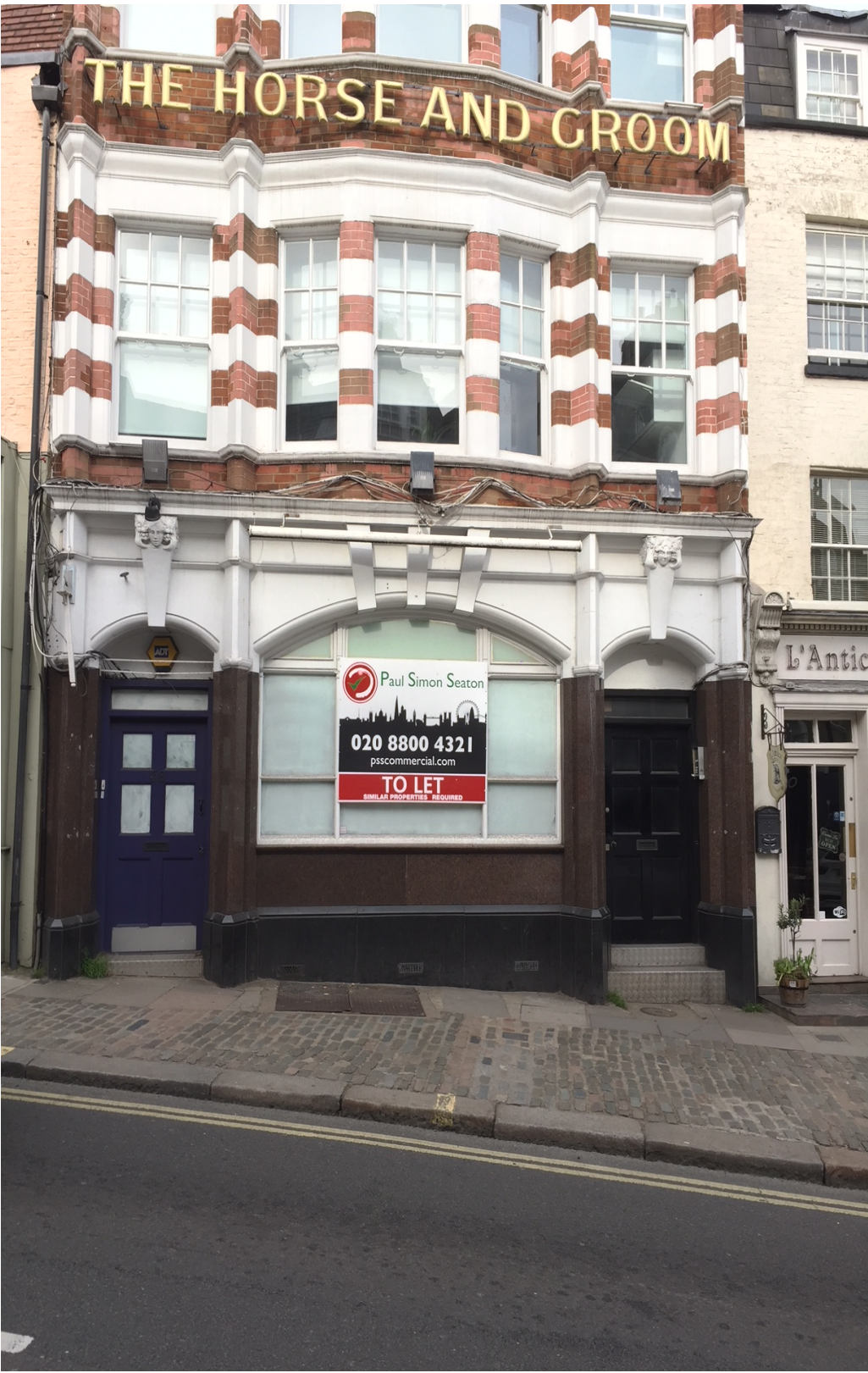
2 External Elevation reference Scale: Not to Scale