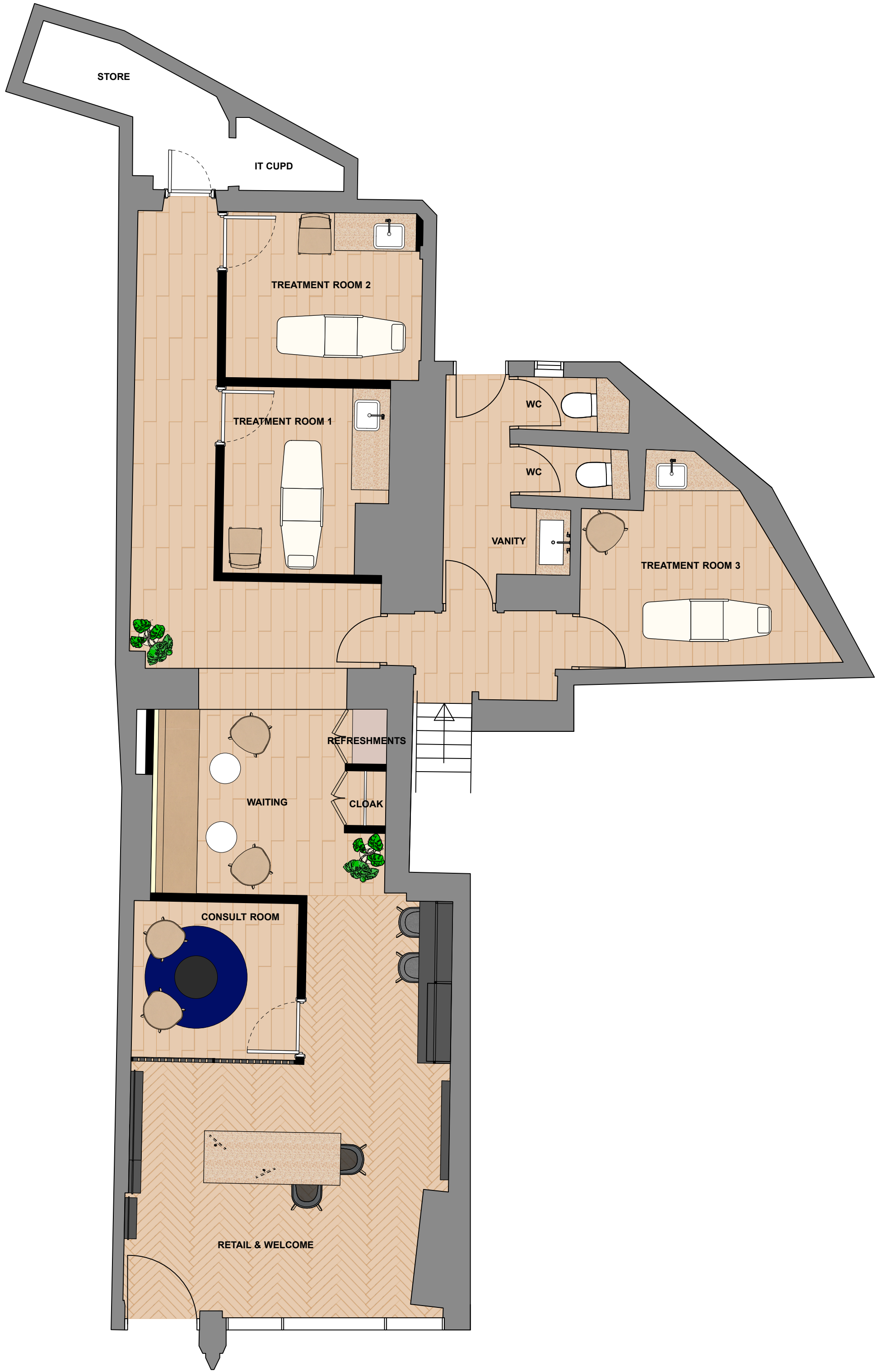
1 Ground Floor Proposed Plan Scale: 1:50