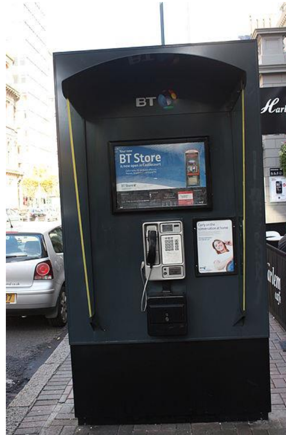
BT Street Talk 6 Kiosk