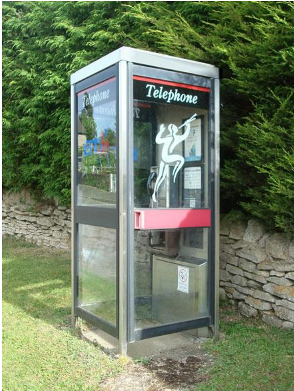
BT KX100 kiosk