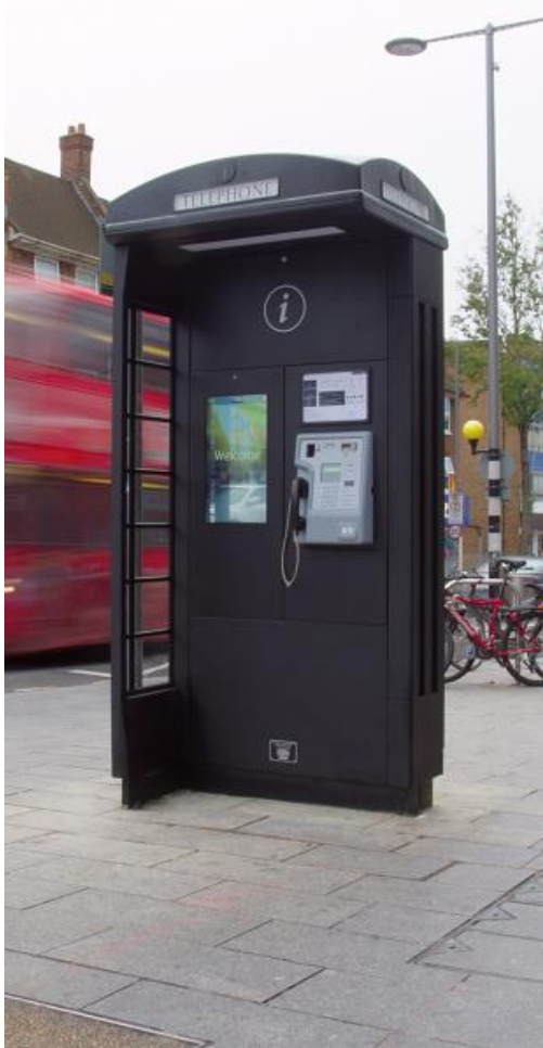
New World Payphones Kiosk