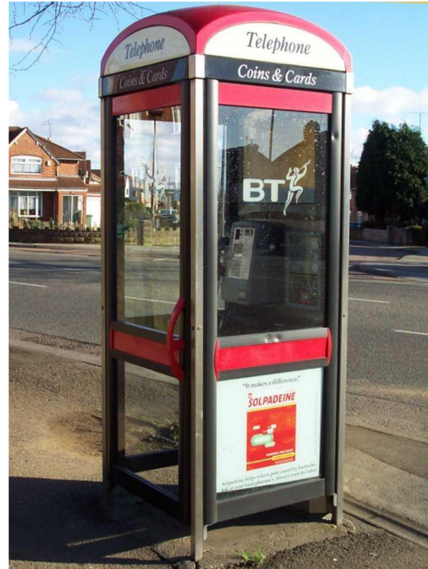
BT KX100+ kiosk