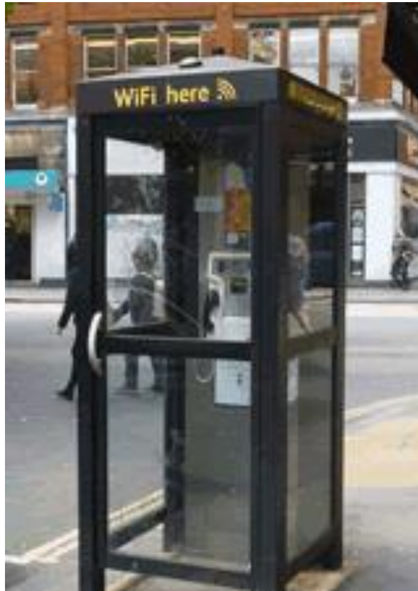
New World Payphones 'Modern' Kiosk