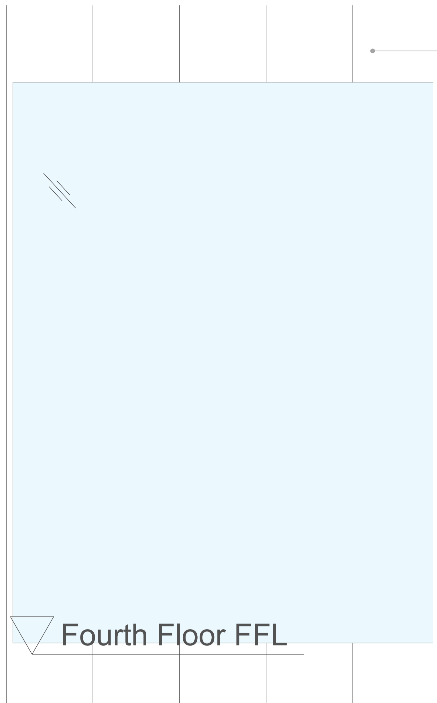
Typical Window Type 2 Elevation 1:10 @ A1

Fourth and Fifth story extensions to use Natural Anodised Aluminium cladding, see accompanying manufacturers details for fixings.