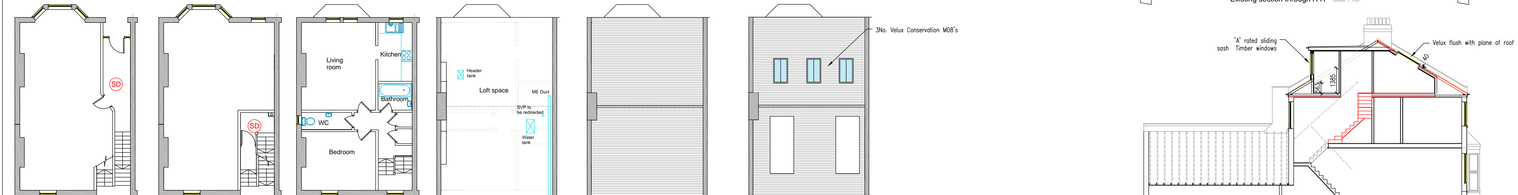
Existing ground floor - Scale 1:100 - Common entrance and ground floor flat A Existing first floor - Scale 1:100 - Common entrance and first floor flat B Existing second floor - Scale 1:100 - Subject flat Existing loft space - Scale 1:100 - Subject flat Existing roof plan - Scale 1:100 - Subject flat Proposed roof plan - Scale 1:100 - Subject flat