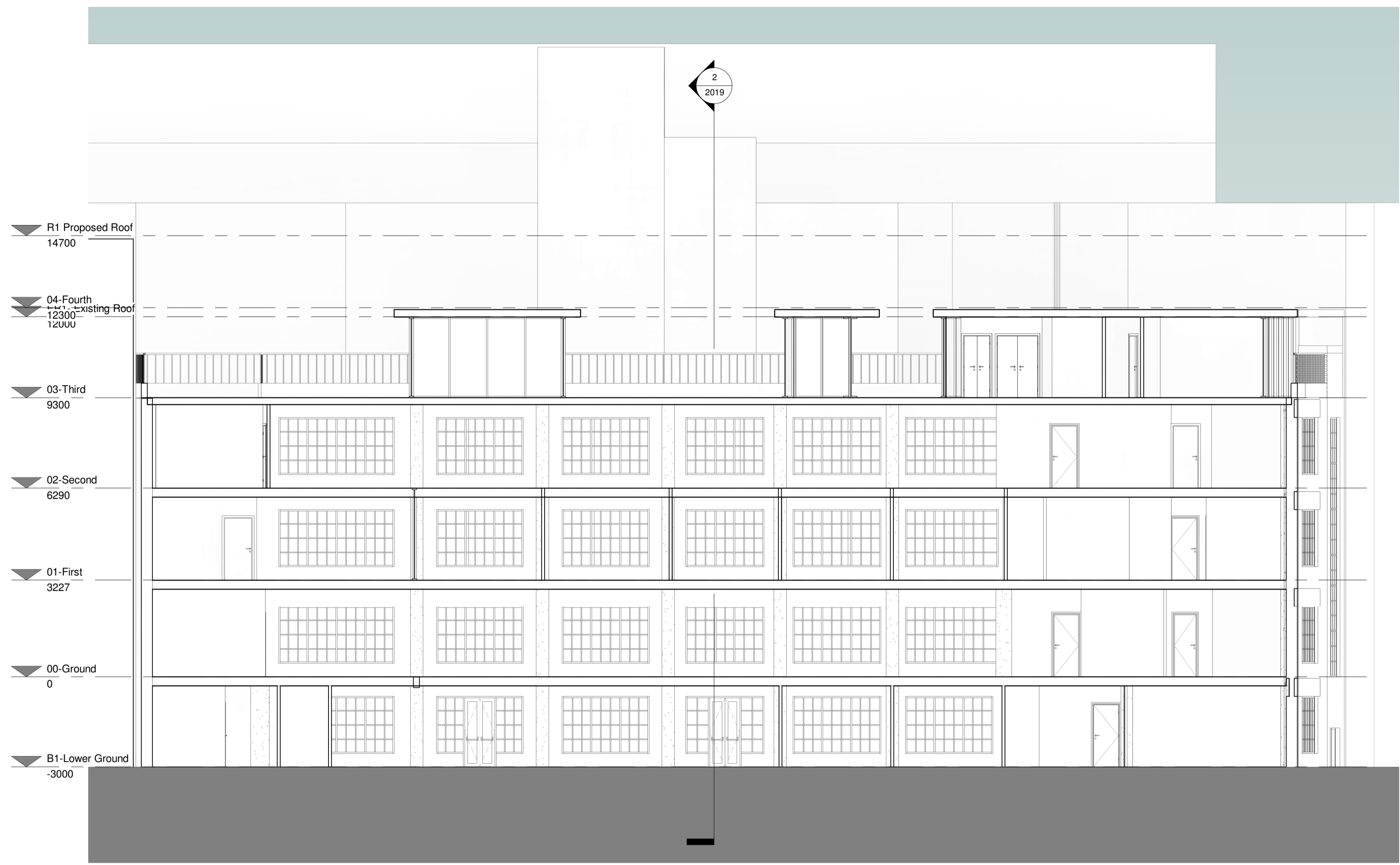
1 Section AA 1 : 100