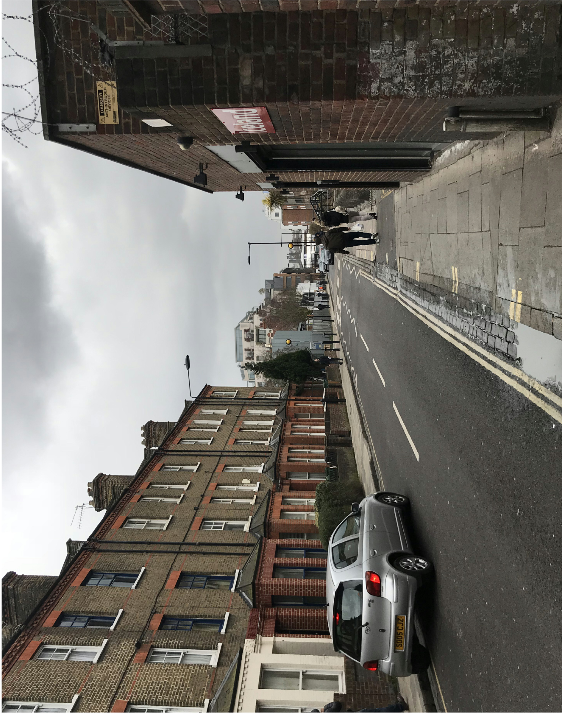
PROPOSED VIEW 1