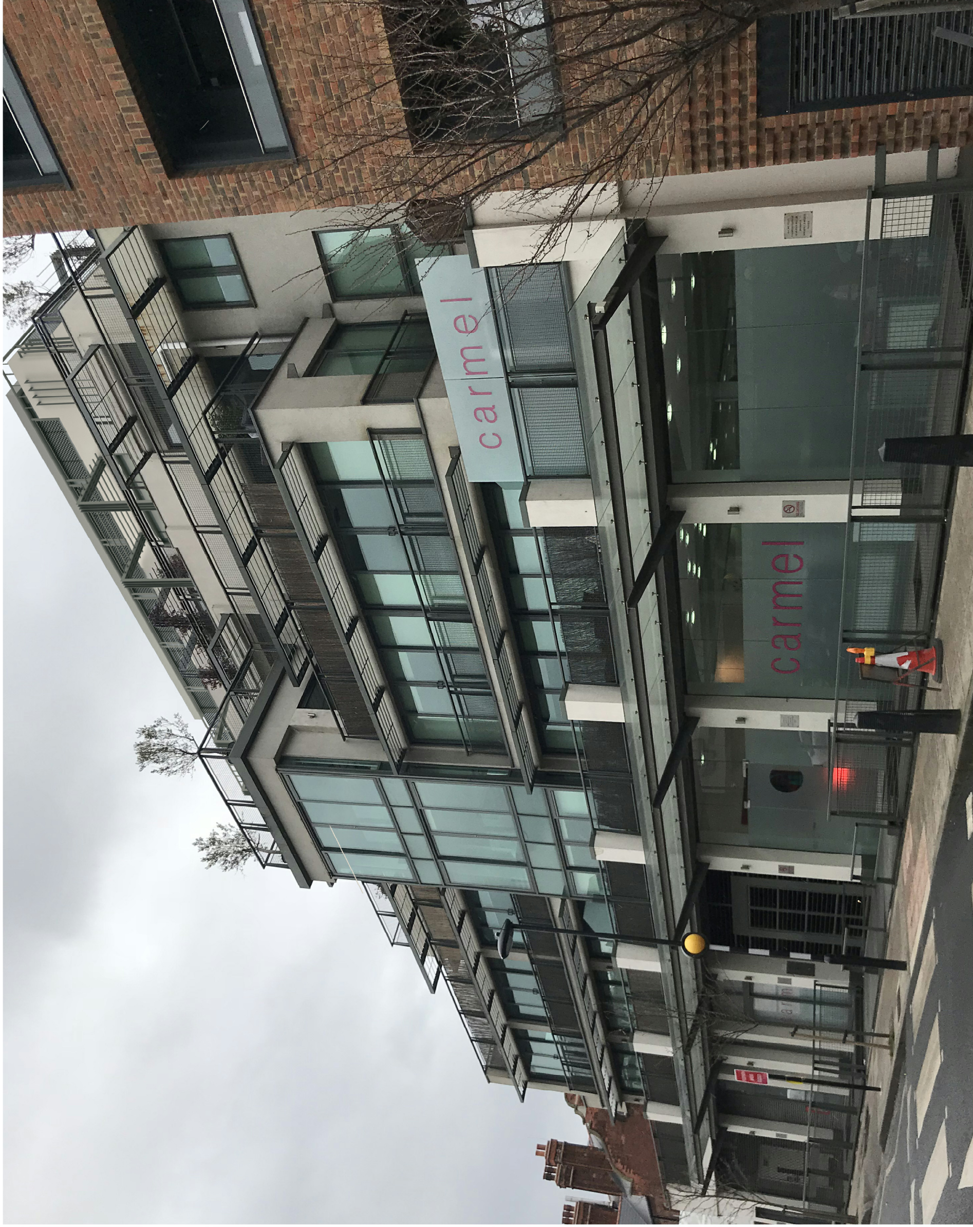
PROPOSED VIEW 5