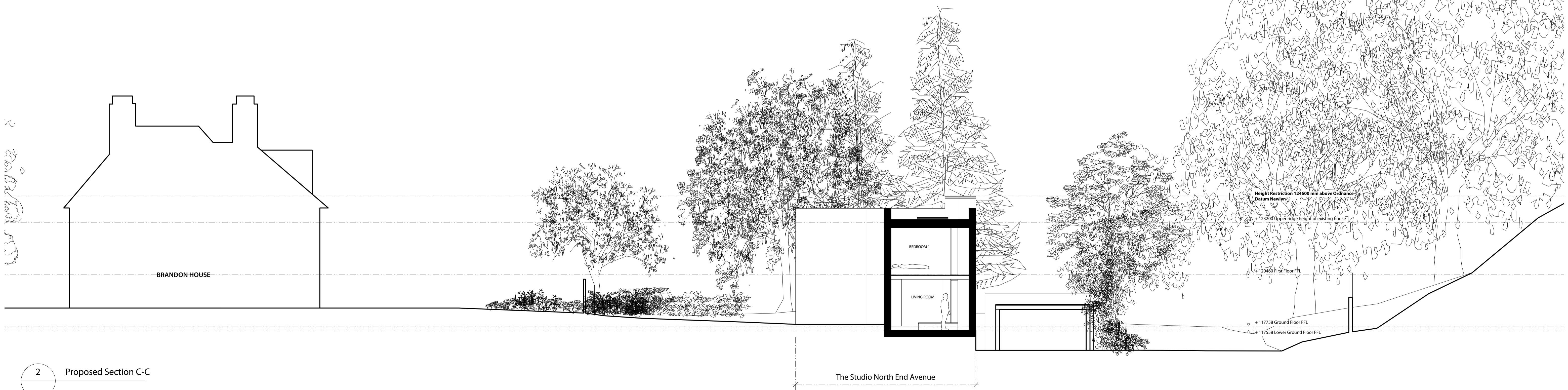
2 Proposed Section C-C