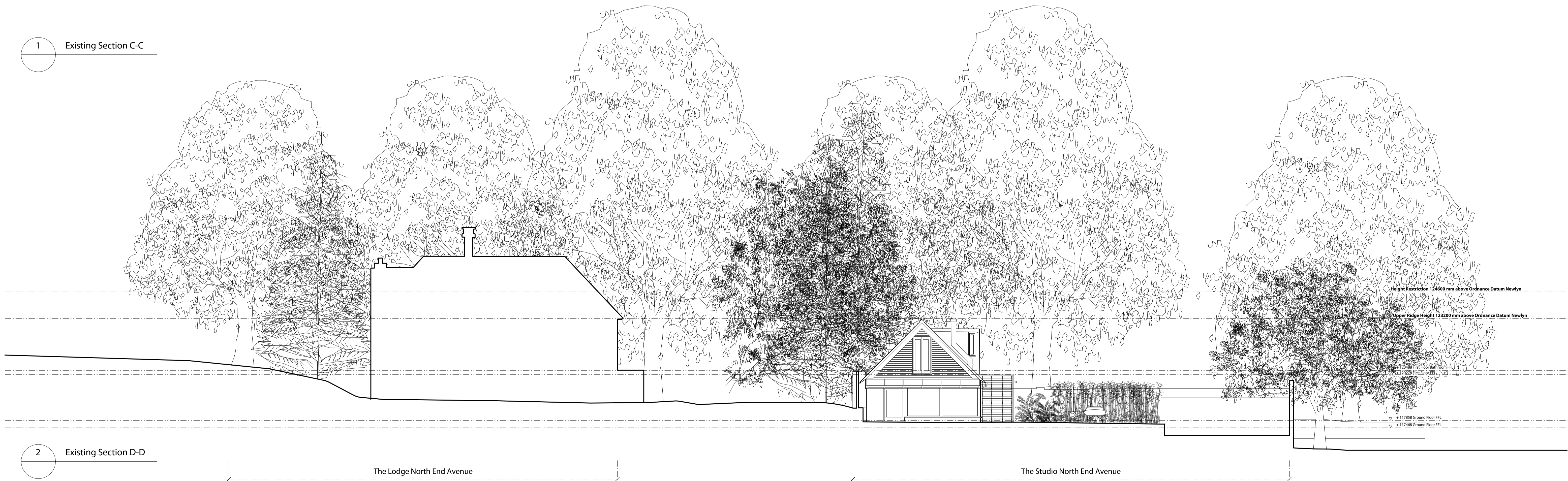
2 Existing Section D-D