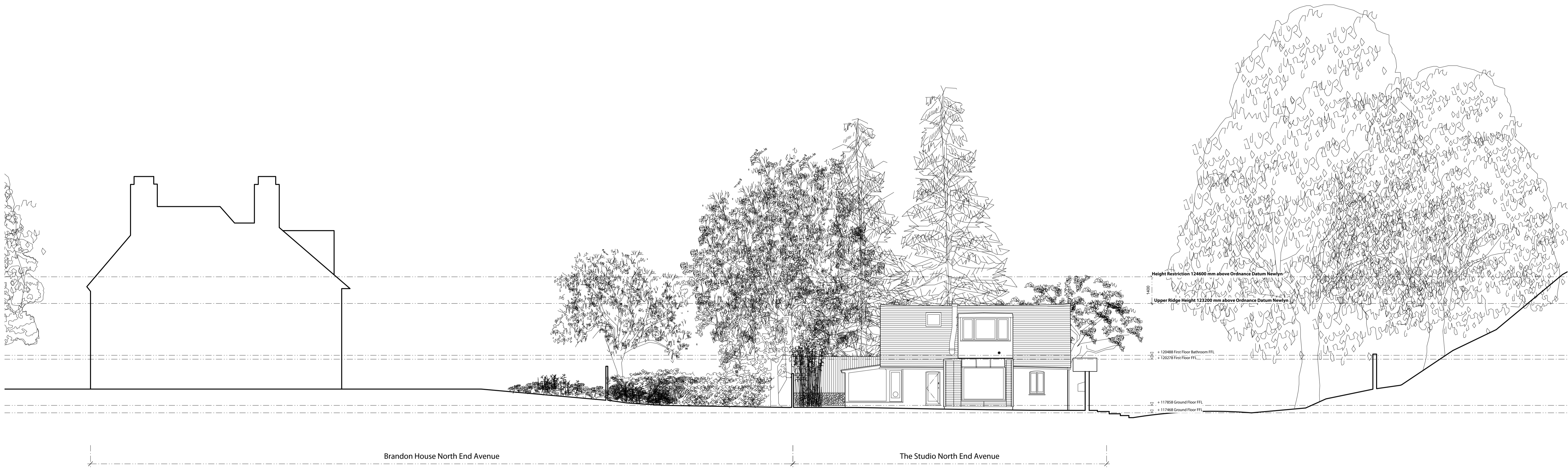
1 Existing Section C-C