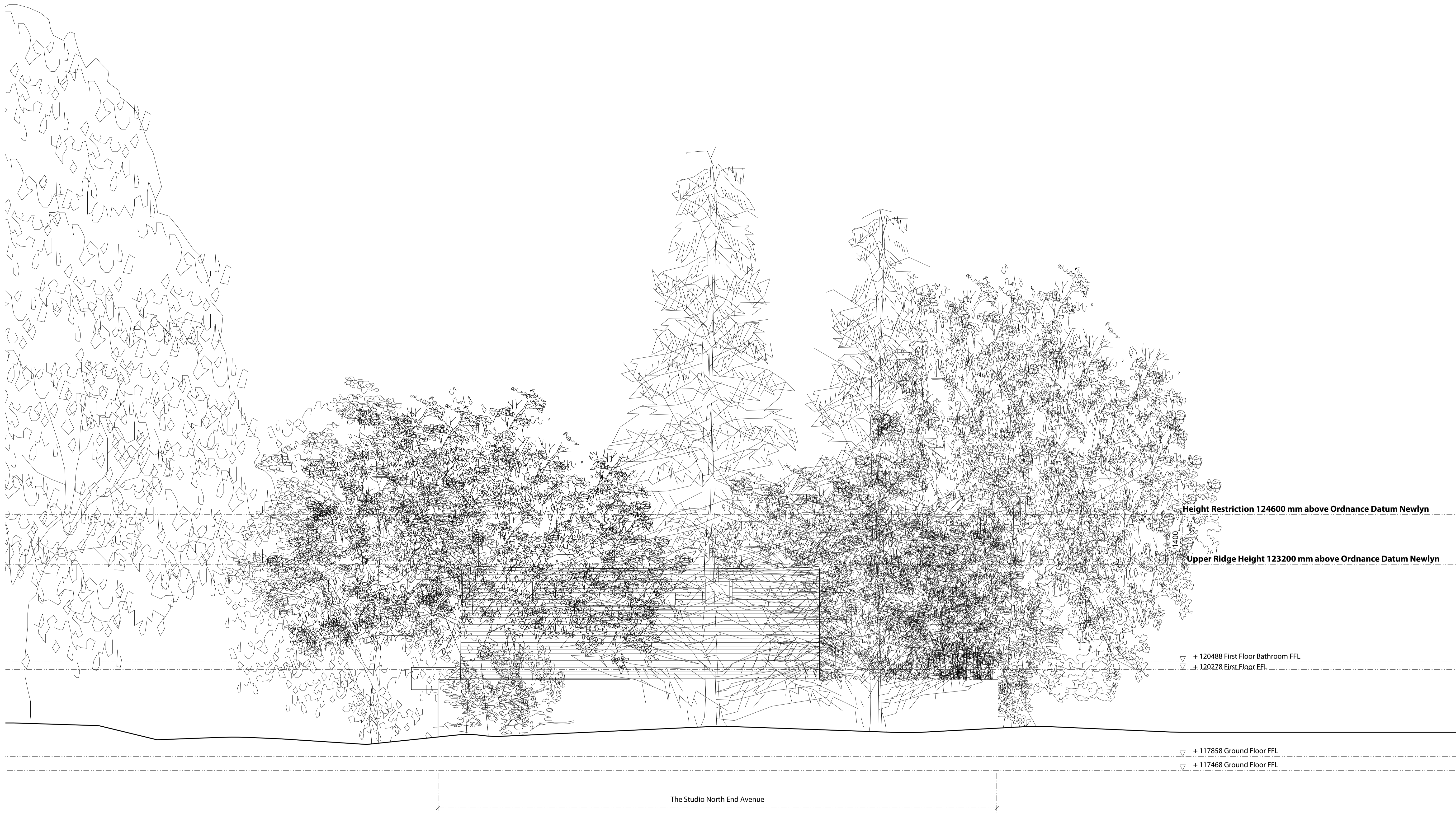
1 Existing South Elevation