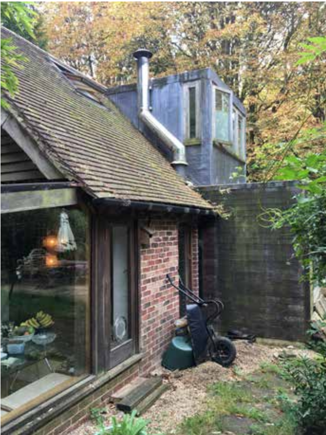
A view of the Studio from the garden, 2016