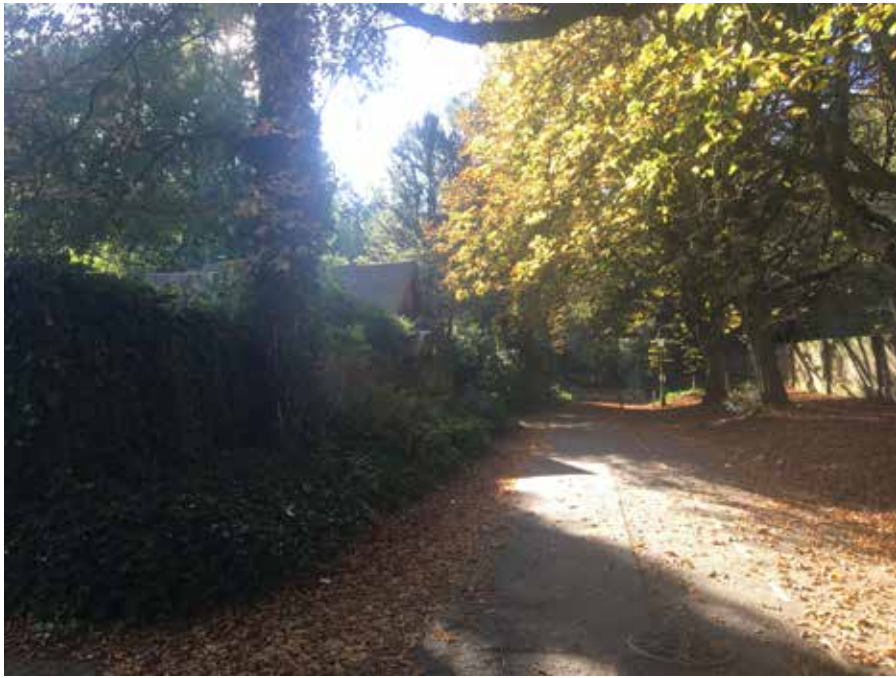
Approach from North End Avenue looking south towards Hampstead Heath fire gate, 2016