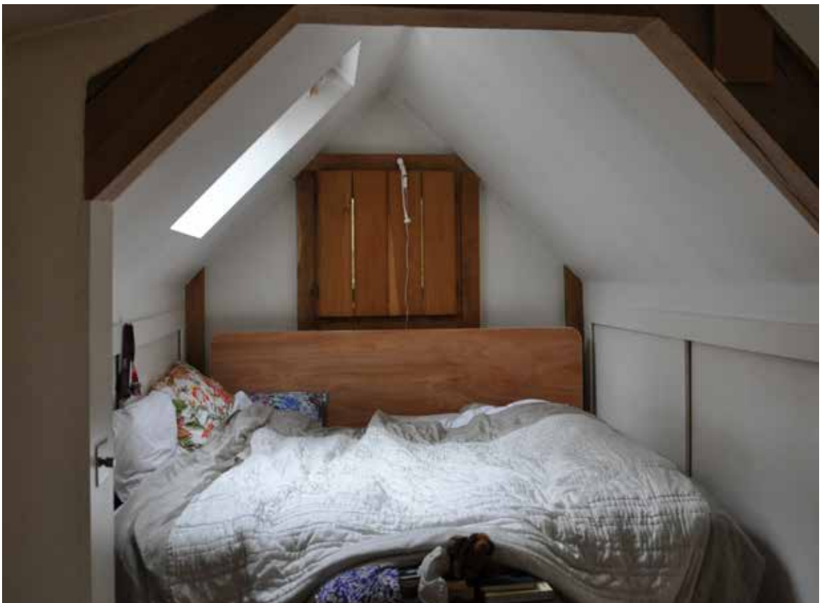
Bedroom 1, first floor, with limited access and headroom, 2016