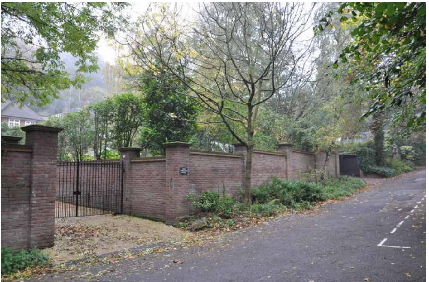
Brick boundary walls to North End Avenue, 2017