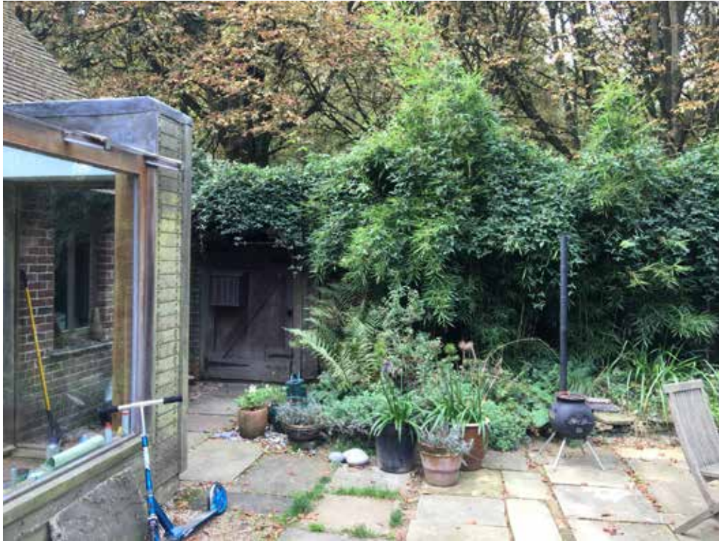
The entrance gate and vegetated brick boundary wall to North End Avenue, 2016