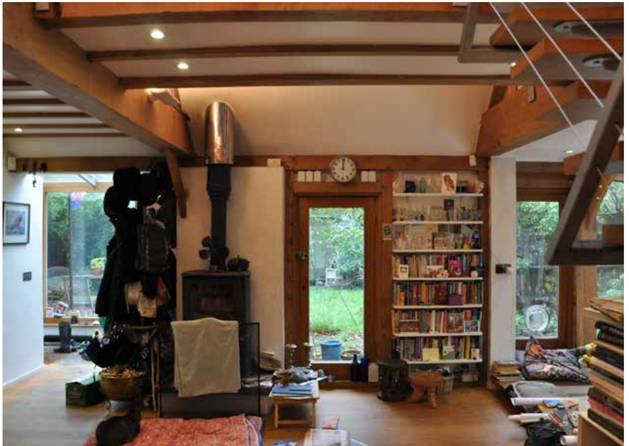
Living room looking towards the garden, 2017