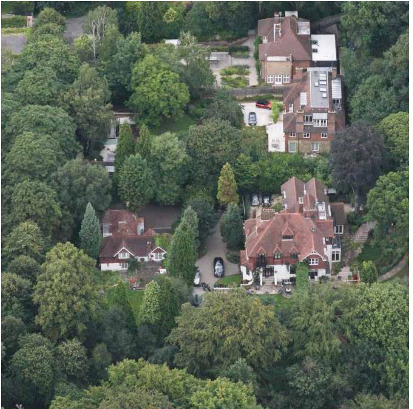
Aerial view: No. 3 North End Avenue, The Studio, Brandon House, The Lodge, Northstead & Northgate, 2018