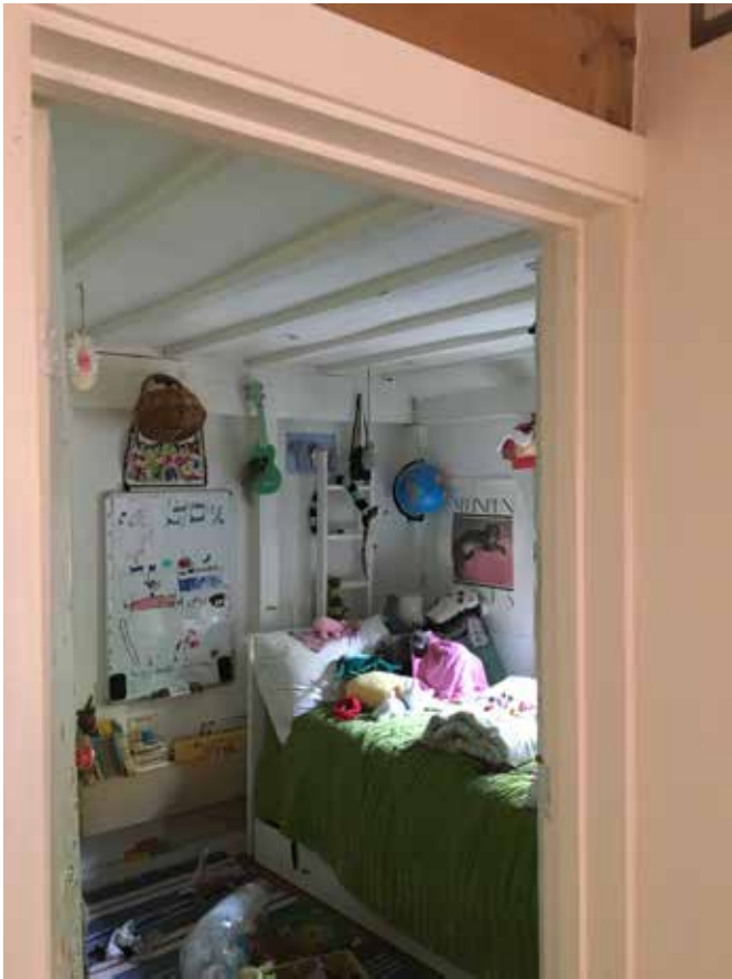
Ground floor bedroom 1, 2016