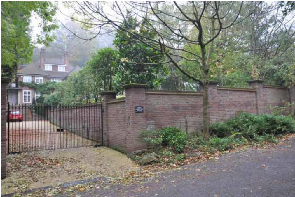
No. 3 North End Avenue, 2017