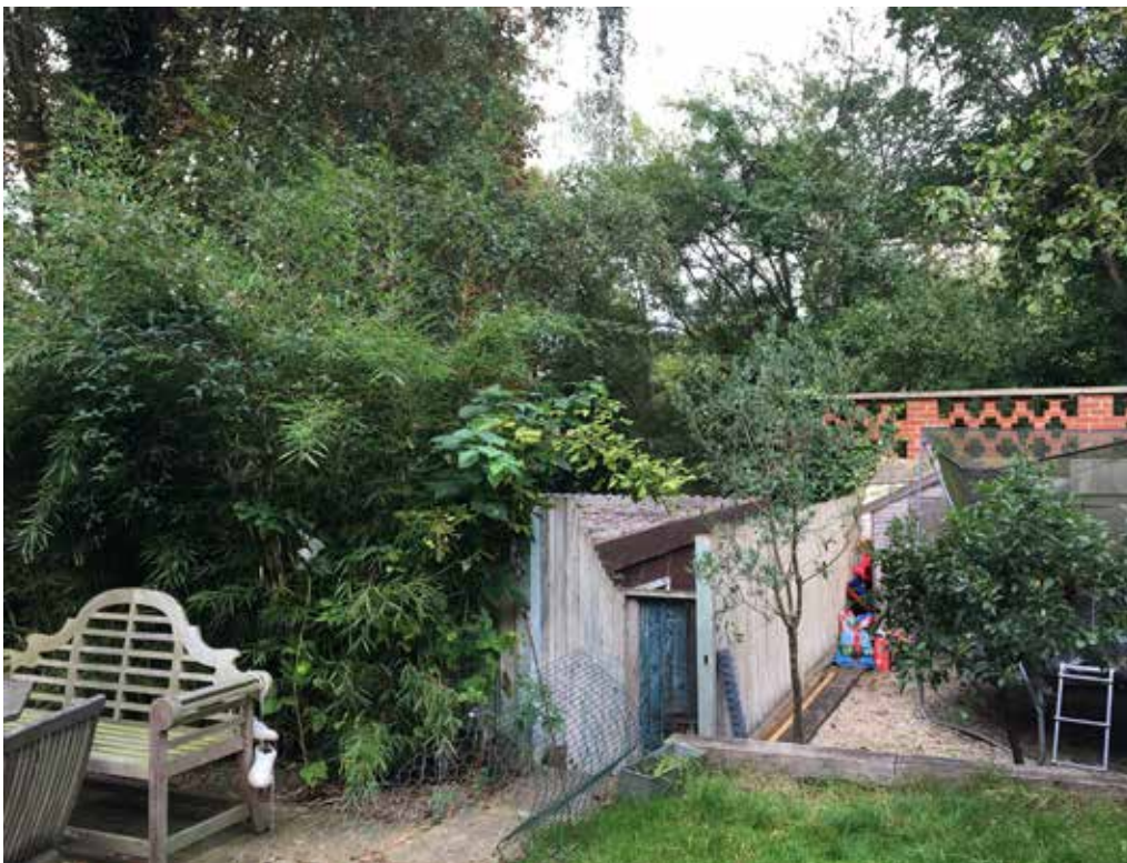
A view of the neighbouring garage to the North West of the site from the garden, 2016