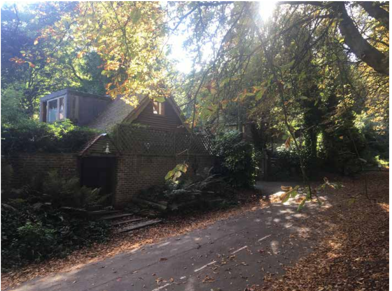
Entrance to The Studio from North End Avenue, 2016