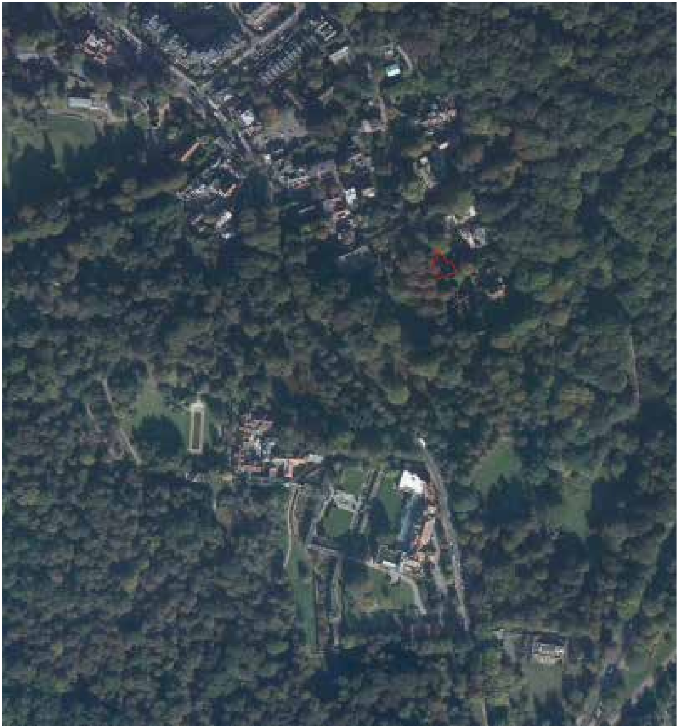
Aerial view, 2018