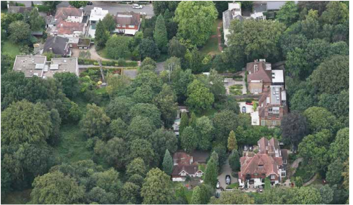
Birds eye view: The Studio & surrounding context, North End Avenue, 2018