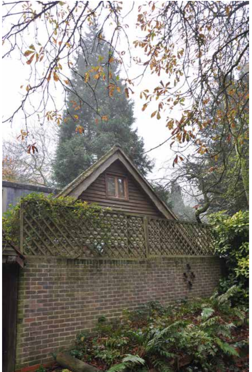
The Studio's adjacency to the brick boundary wall, from North End Avenue, 2017