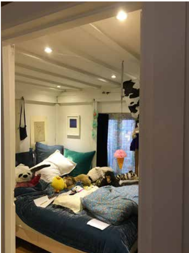
Ground floor bedroom 2, 2016