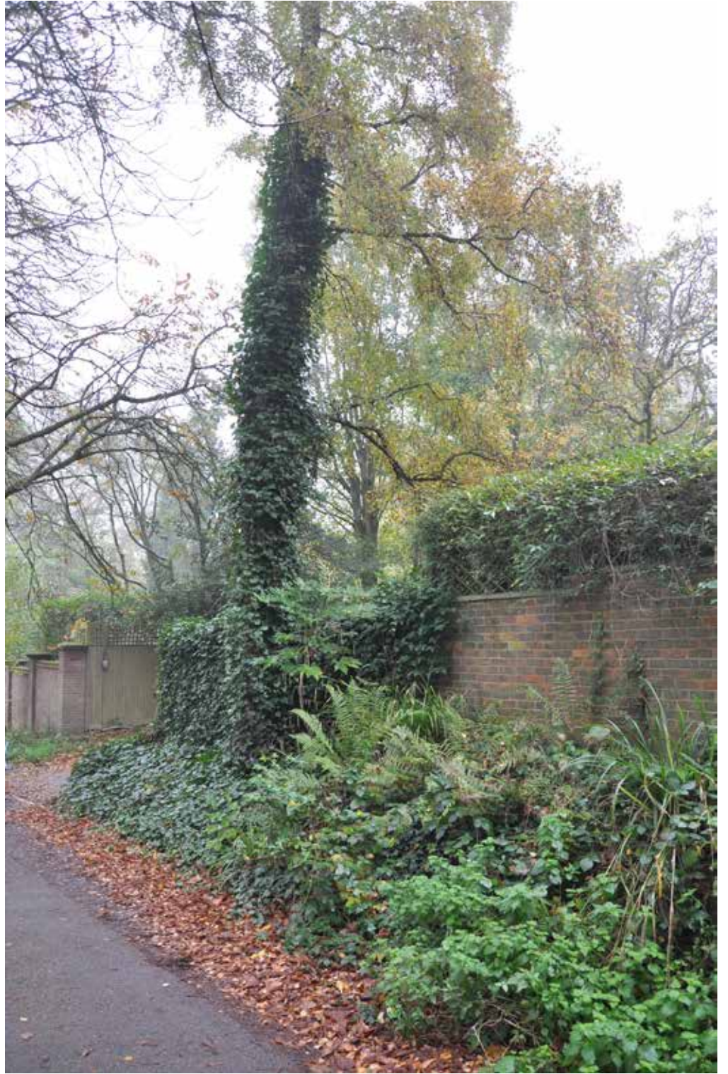
Vegetated verge and Silver birch to the west of the site on North End Avenue, 2017