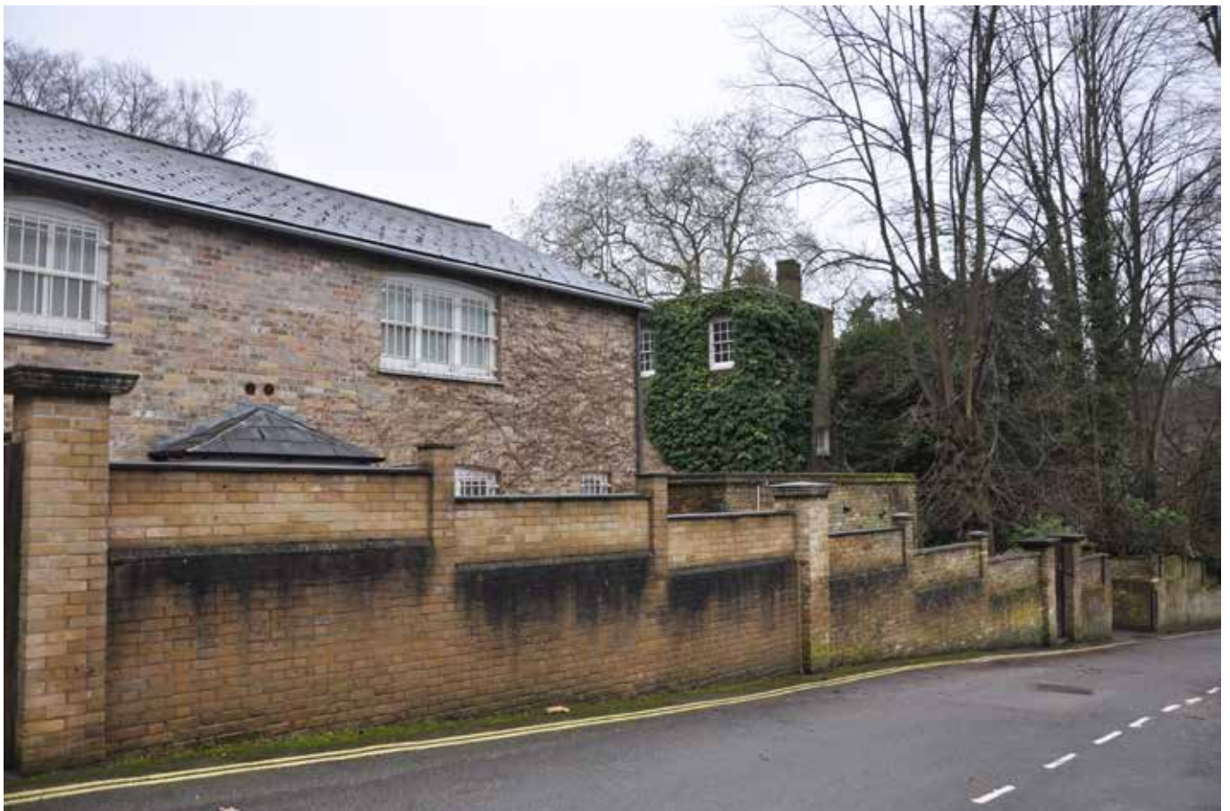
Cedar Lodge, North End, 2018