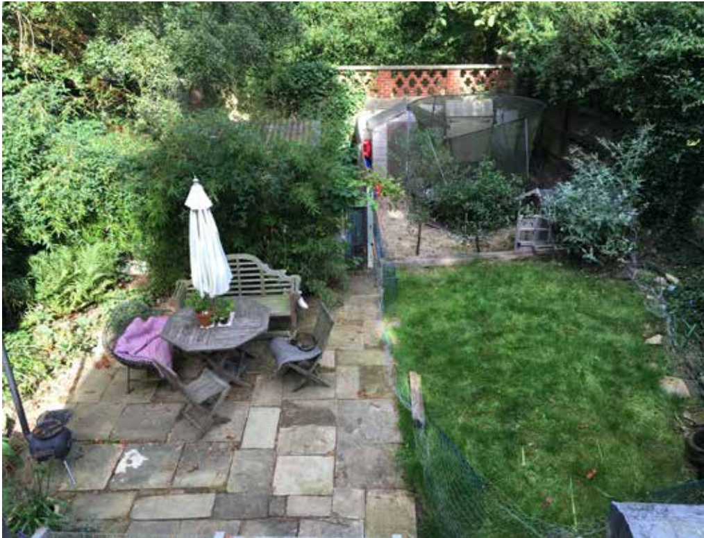
A view of the garden, looking North from the house, 2016