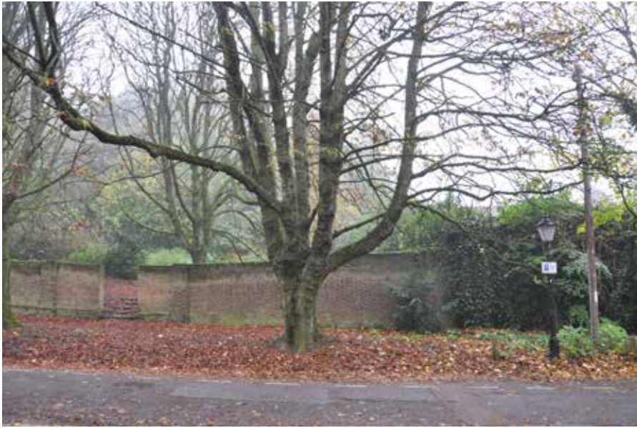
Grade II Listed brick wall opposite The Studio, taken from North End Avenue, 2017