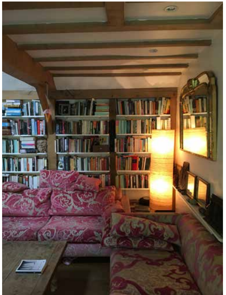
Living room, 2016