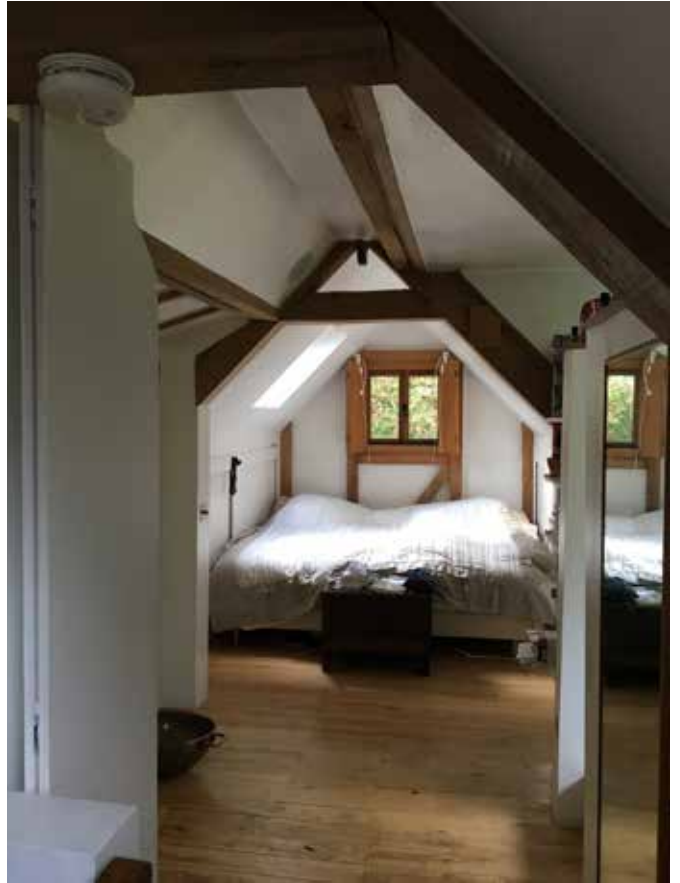
Bedroom 1, first floor, 2016