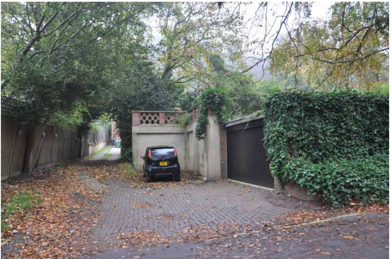
Access to Brandon House, and garage to the North of the site, 2017