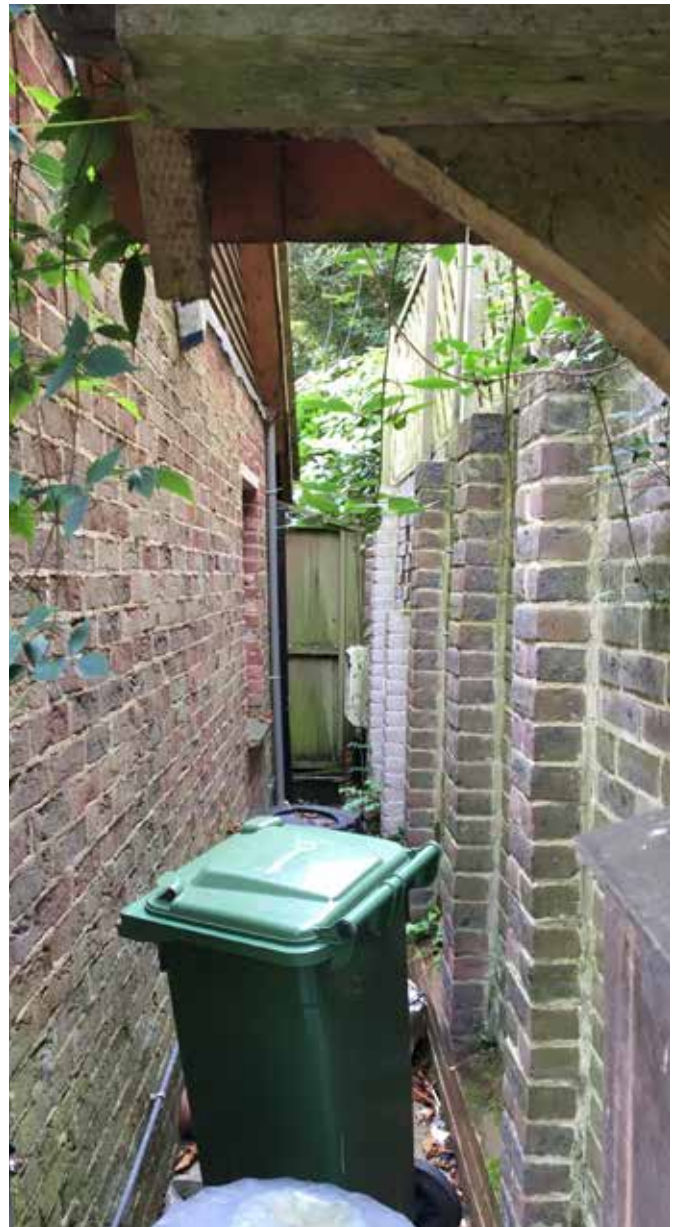
Ground floor bedroom window less than 1m from boundary wall, 2017