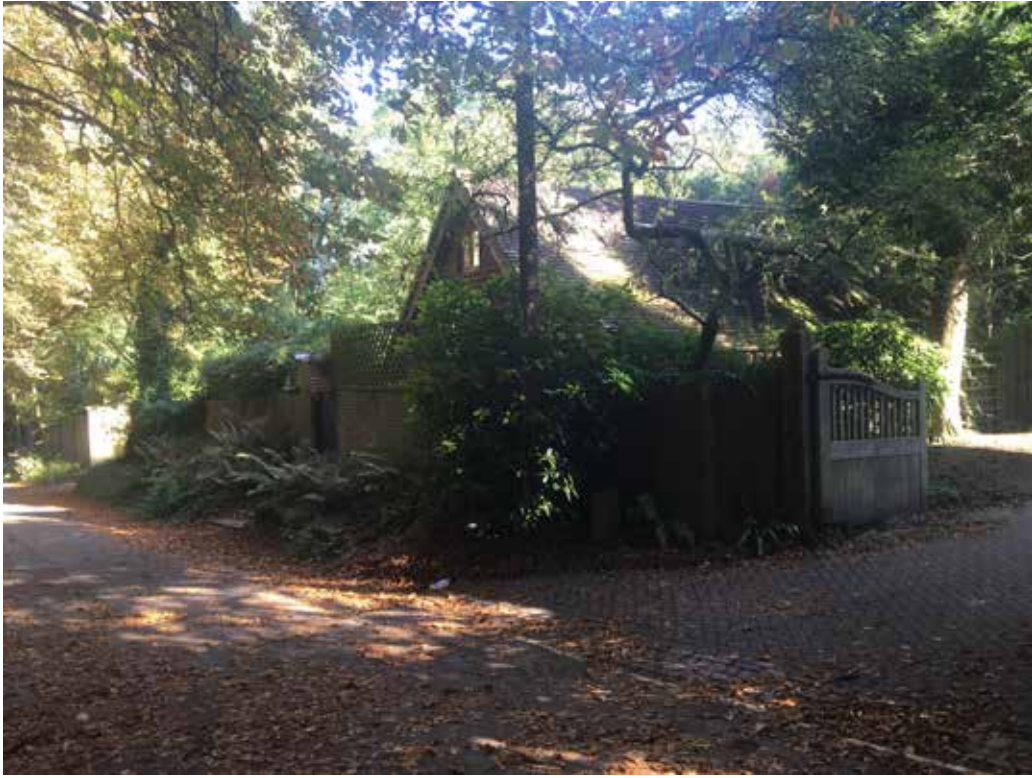
The Studio, and entrance gate to The Lodge, Northgate & Northstead, 2016