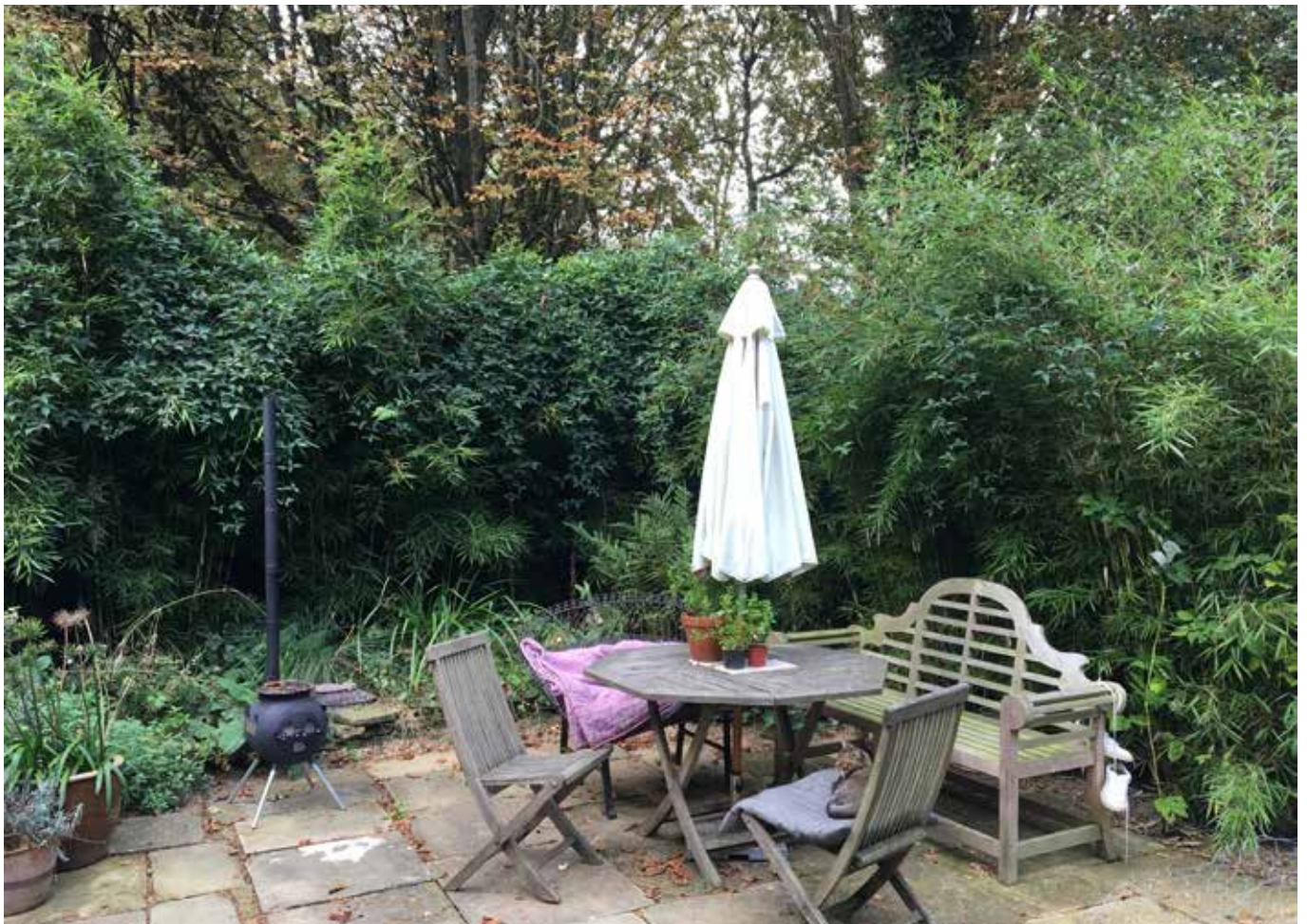
The garden and vegetated boundary to North End Avenue, 2016