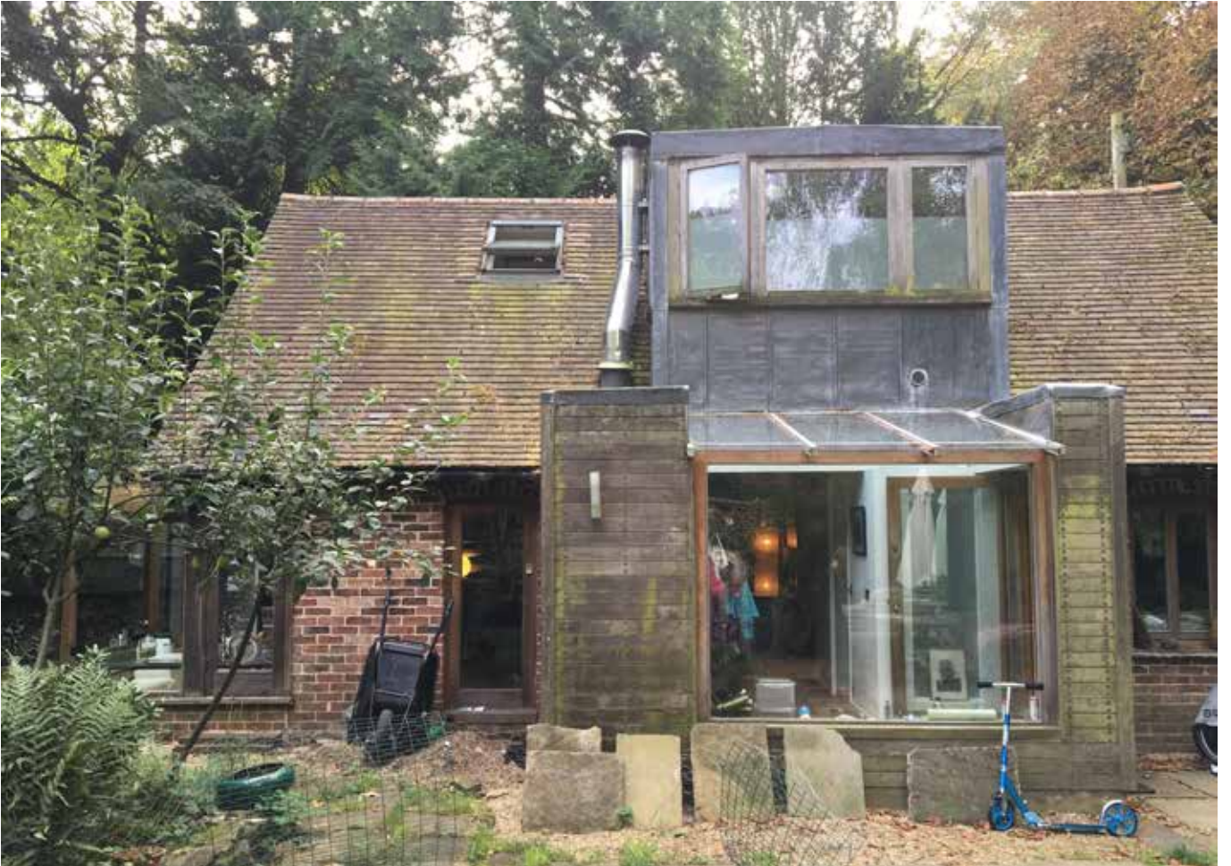
North Elevation of The Studio from the garden, 2016