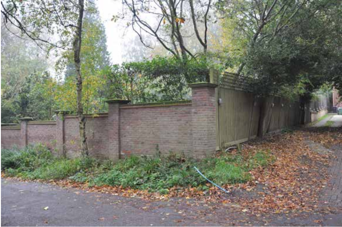
Boundary wall to no. 3 North End Avenue, 2017