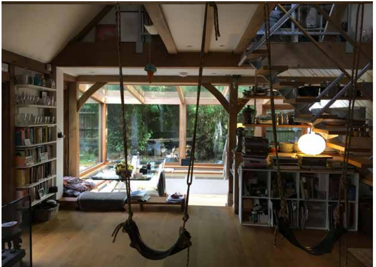
Living room, kitchen & dining room, 2016