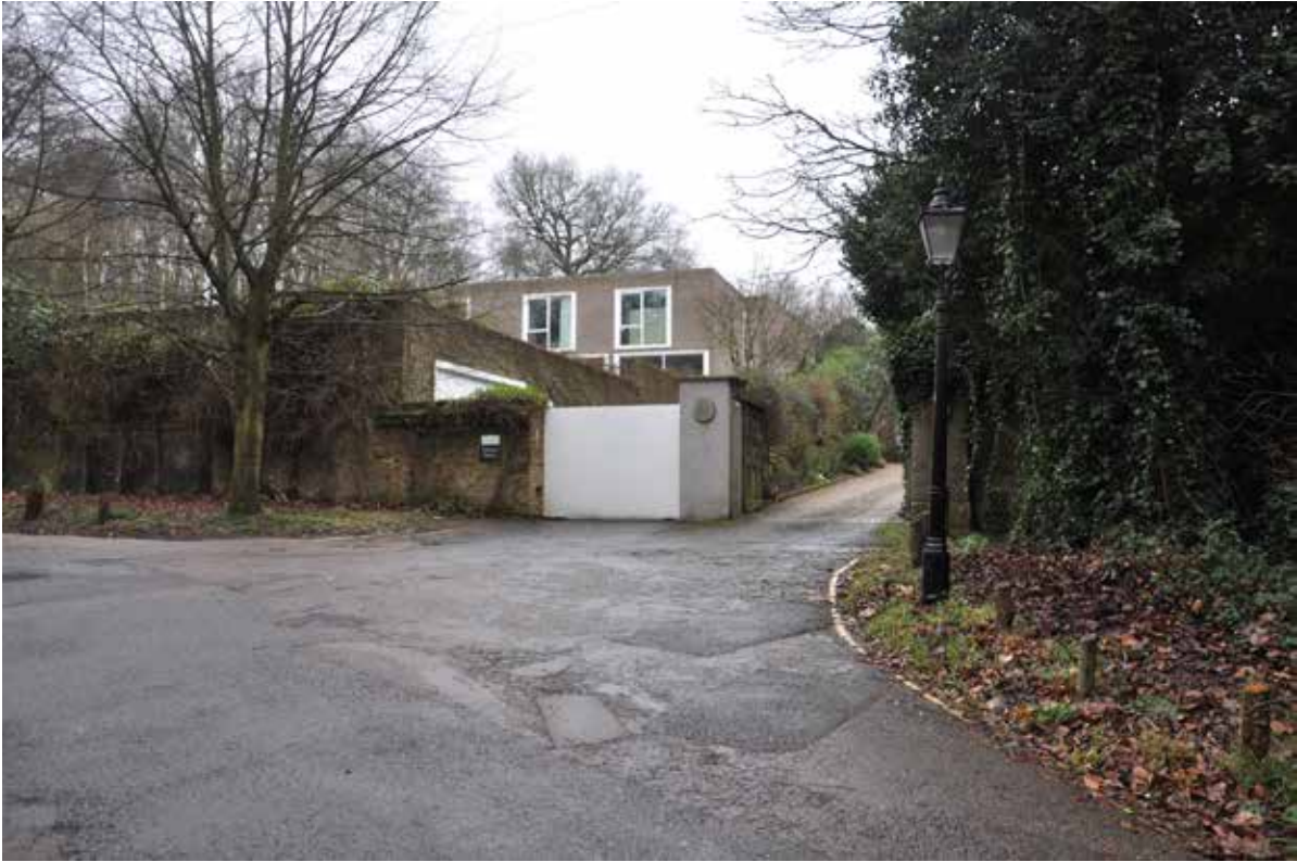
Terrace House to the North of the site, North End Avenue, 2018