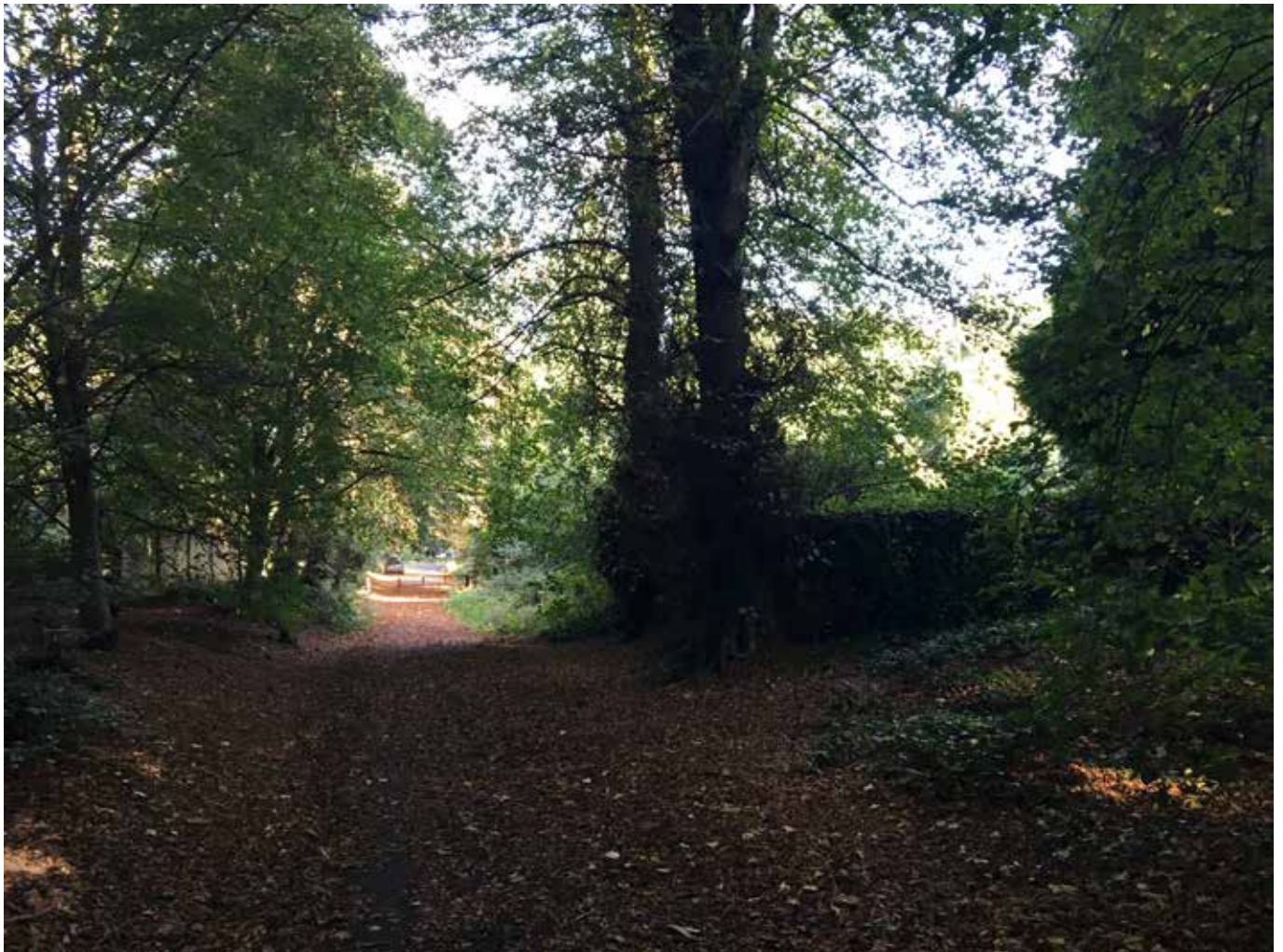
The Approach from Hampstead Heath, 2016