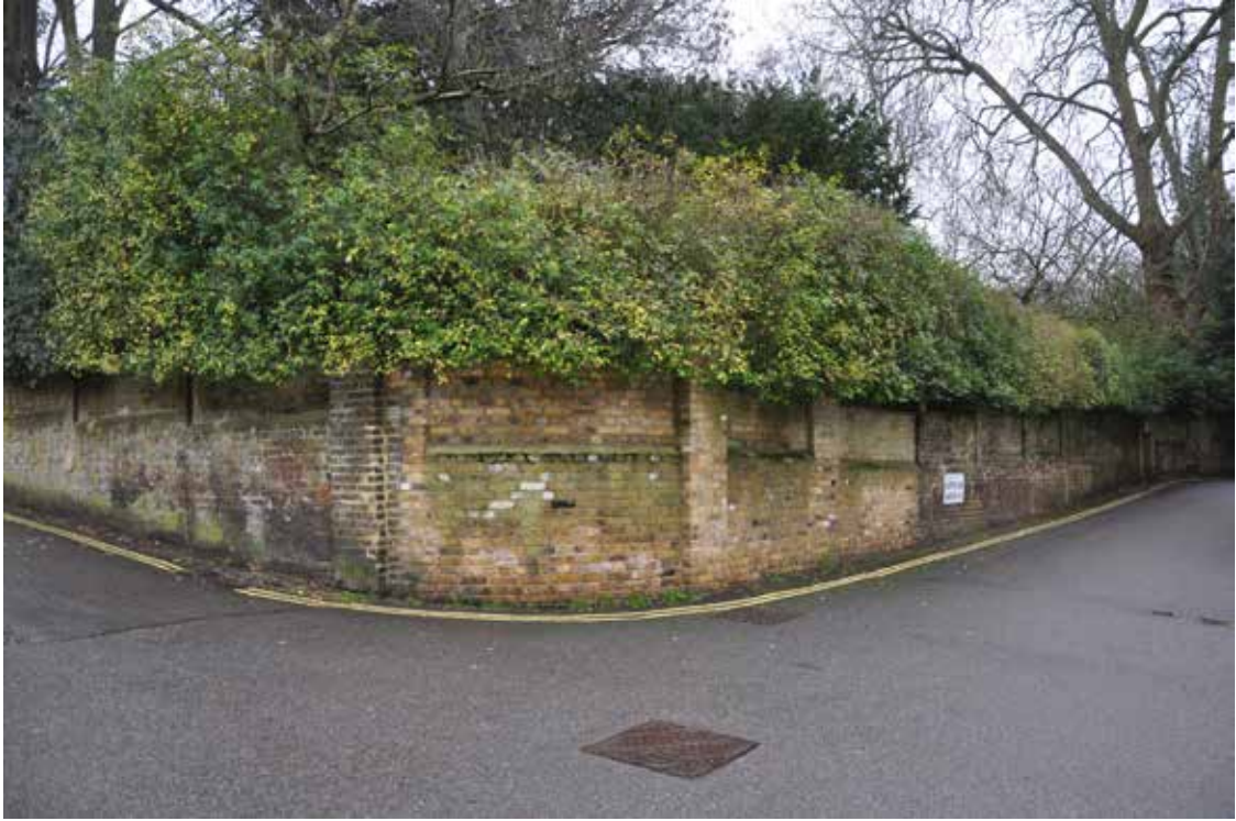
Brick boundary wall to North End Avenue, 2018