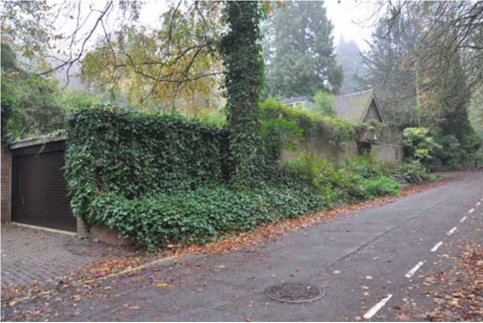
The Studio from North End Avenue, 2017