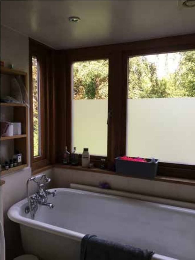
Main Bathroom, 2016