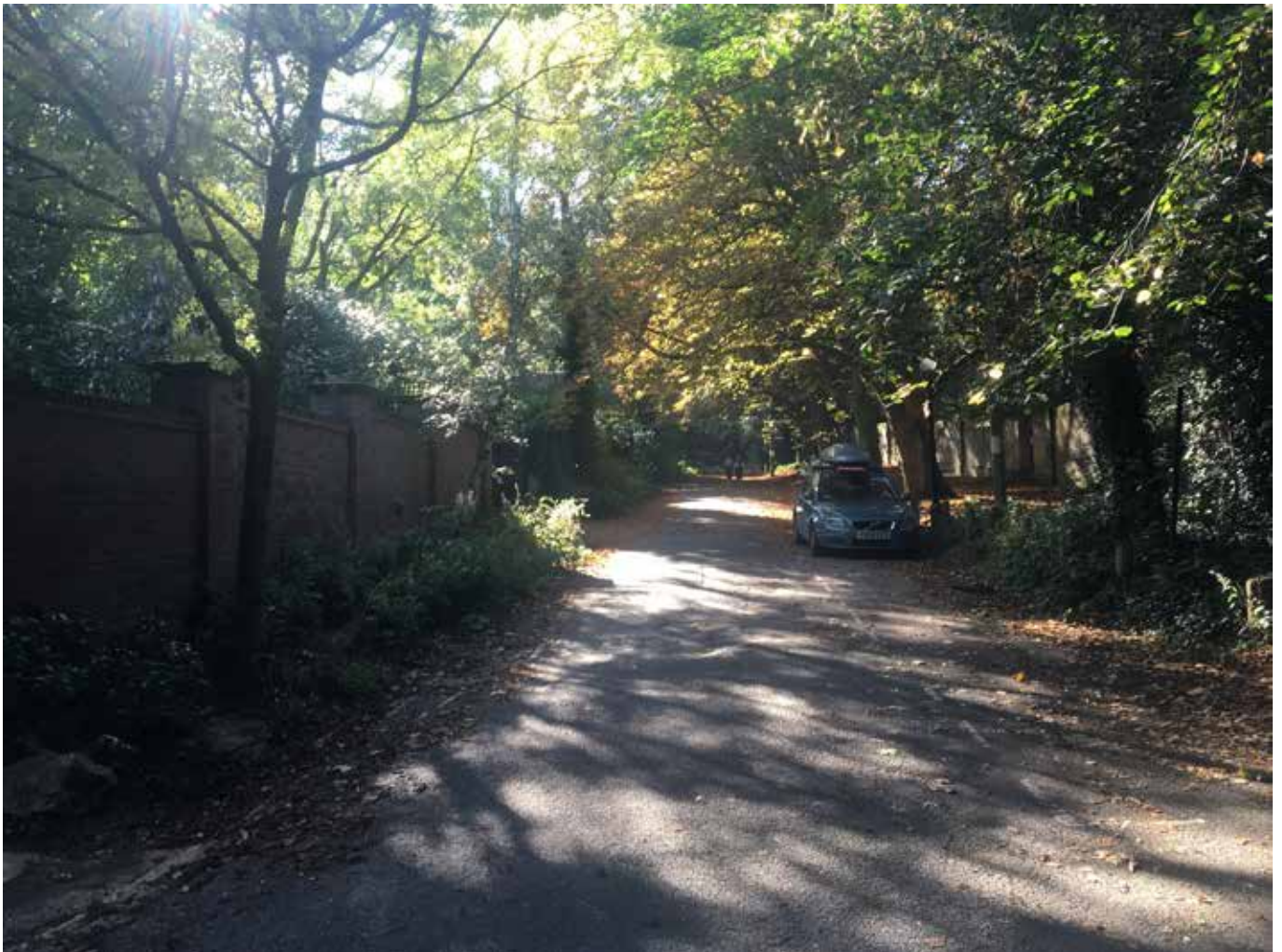
North End Avenue looking south towards Hampstead Heath fire gate, 2016