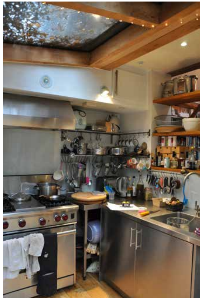
The kitchen, 2017