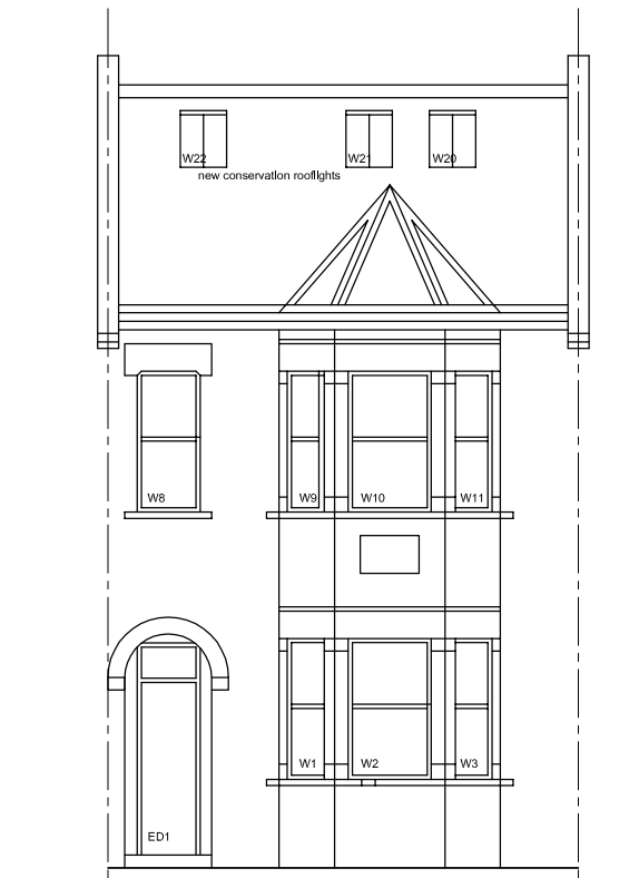
FRONT ELEVATION As proposed