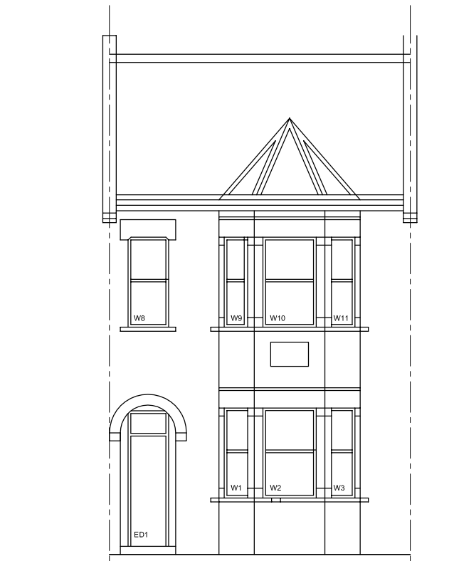
FRONT ELEVATION As existing