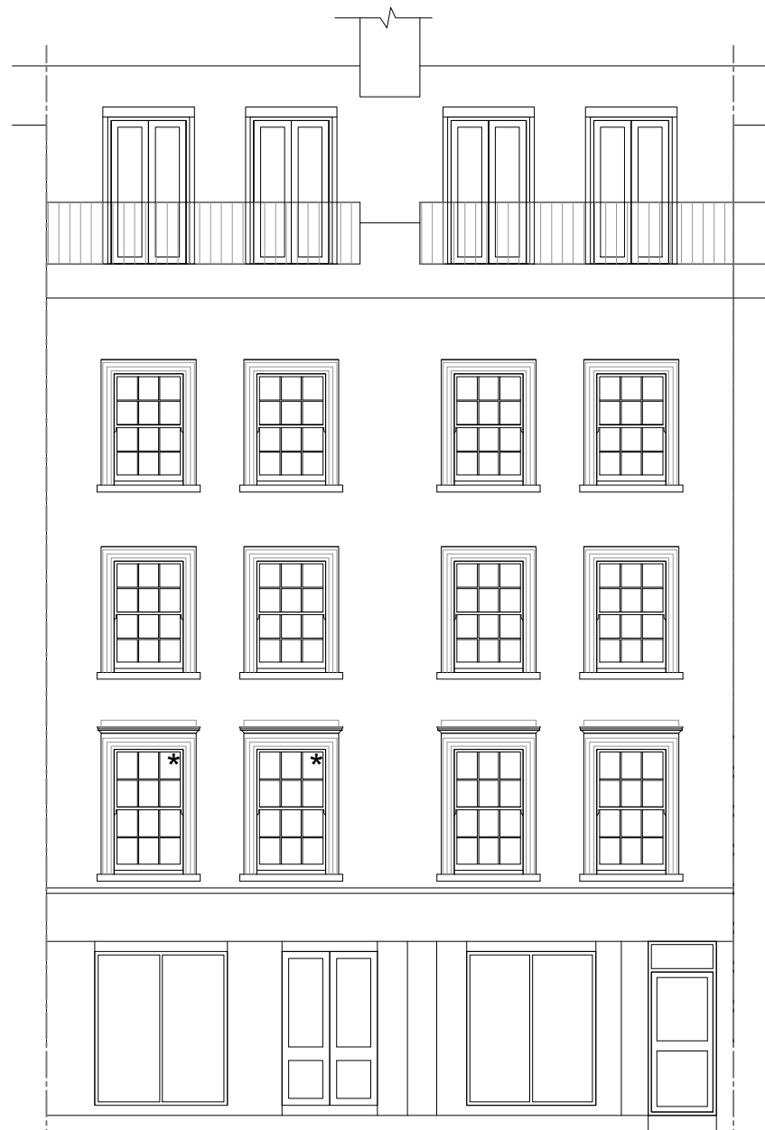
EXISTING FRONT ELEVATION SCALE 1:100 @A3