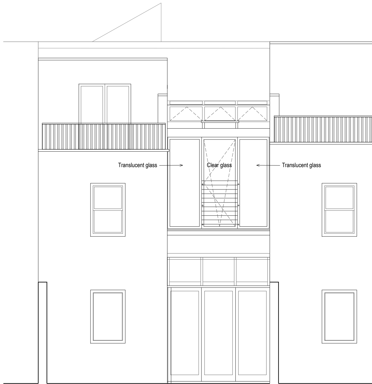
1 Proposed Rear Elevation Scale 1:50 at A3